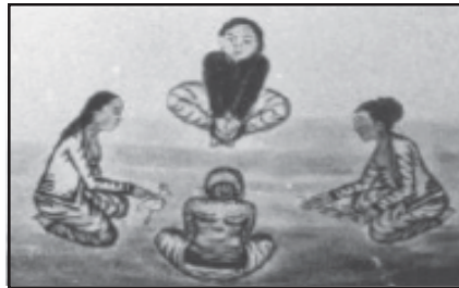
Indonesian traditional playing is parallel to art activities (The Dolanan Anak Jawa, 1920)