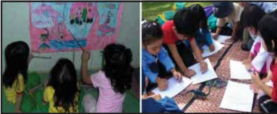
Art education as able to be applied for children since a very early age (Bumi Limas, 2007)