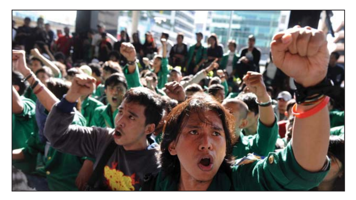
Democracy in Indonesia: Between Hope and Reality

The break of Reform waves in 1990's has brought a new hope of demoracy development and of realizing a civil society in Indonesia, though it left many unresolved social phatologies in the transition periods. Building a strong foundation of democracy and civil society, particularly in the transition times, should not only be fought; it shall be nurtured, grown through well-planned efforts targetted to all layers of the whole society.