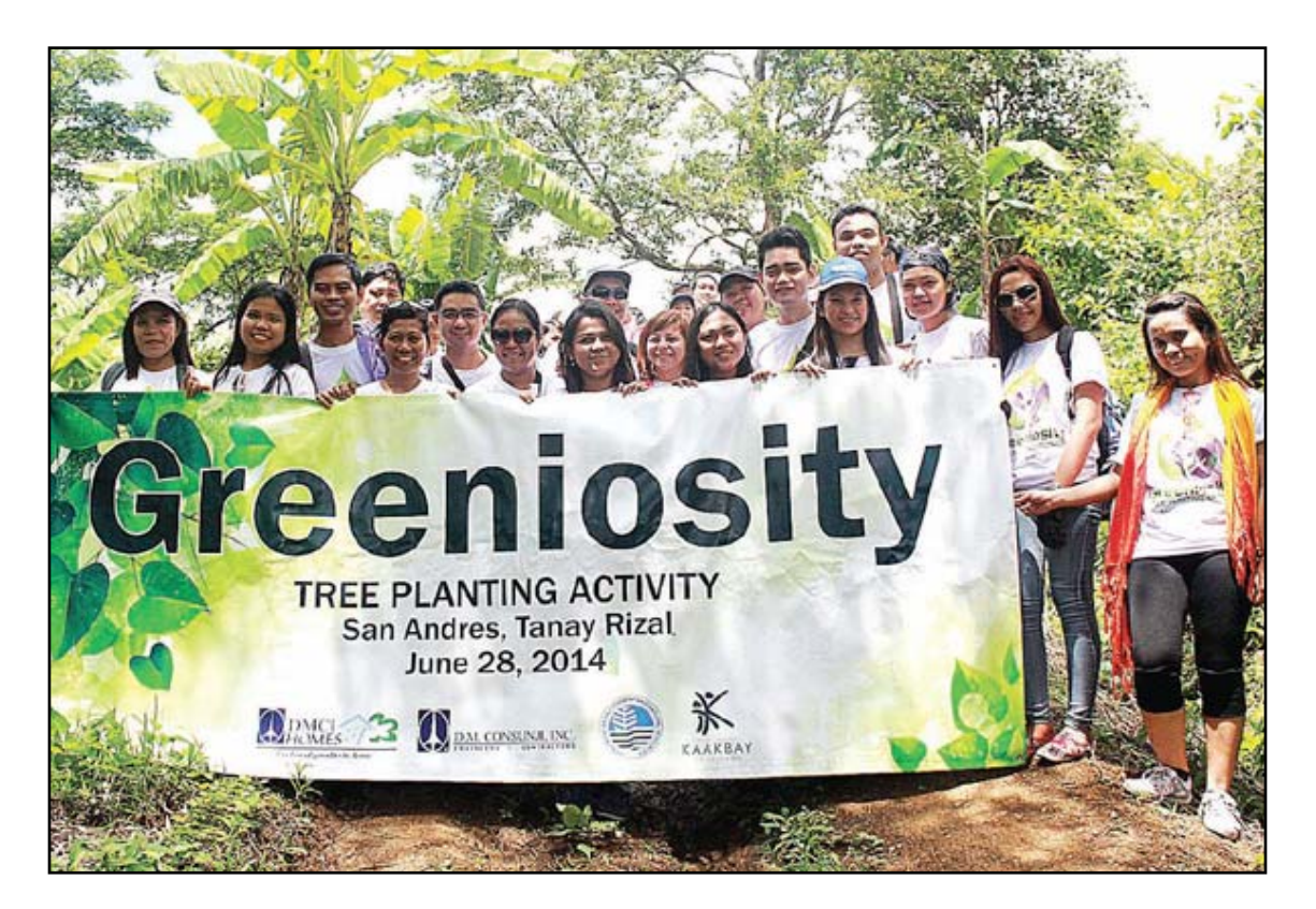
Environmental Education in the Philippines

The selected fourth year high school students in the Philippines manifested moderate awareness on the different concepts, issues, and problems of the environment. As an outcome of their awareness, students sometimes do the tasks, which pertain to recycling, water and energy conservation, non-use of harmful products, creative possible solution, and social media exposure. However, they seldom do the tasks of tree-planting, clean-up drive, and participating to school's environmental club.