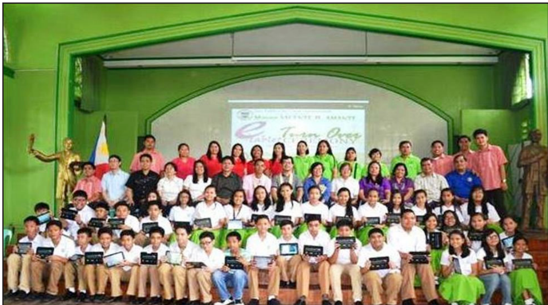
Students of San Pablo City National High School in the Philippines

The participants of this study were graduating high school students of San Pablo City National High School composed of five hundred seventy-five students. The participants belong to the last batch of basic education curriculum for the school year 2014-2015, which is being replaced by the new curriculum known as the “K to 12 Program” through the initiative of the Department of Education in the year 2011.