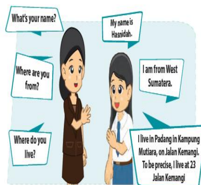
Picture 1. Projective process

Cultural practice are often refers to the traditional practices for specific ethnic culture and especially for the culture that have been practiced since ancient times. The cultural practices are observably from any ritual ethnics, festival events, ceremony and the other custom that done by the certain people or group. Furthermore, Indonesia is a country rich in ethnicity and culture. Each region has distinctive characteristics of different cultures, especially the geographical state of Indonesia. Cultural practice in Indonesia reflects the uniqueness of each region. There are various activities that describe their culture through cultural practices such as ceremonial activity, welcoming guests, wedding ceremonies and funeral ceremony. Cultural practice also shows our national identity.