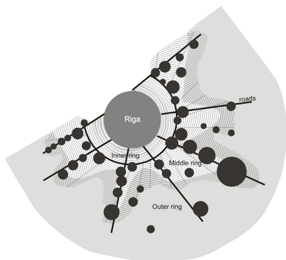
Figure 2. Development circles of suburban area

the second circle contains suburban settlements which in the nearest future will not physically merge with the city, but will be closely functionally related to it.