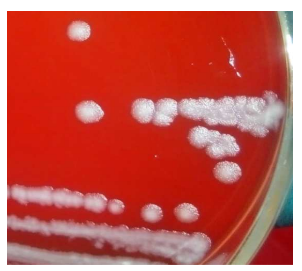
Figure 2. Colony morphology of B. anthracis on Sheep Blood agar, photo taken in June 1, 2019 during anthrax outbreak investigation at the National Animal Health Diagnosis and Investigation Center, Ethiopia.

grown overnight on Sheep Blood agar at 35-37°C. However, on sheep Blood agar (5%) and other routine culture media, almost all Bacillus species grow well [36]. After incubation for 18-24 hours, growth occurs on blood agar and shows the characteristic morphology of grey/white, flat colonies, 2-5 mm in diameter, flat or slightly raised, gray to white with a "ground glass" appearance and described as "tenacious" or "sticky" like petroleum jelly. After 18 hours of incubation on sheep blood agar (SBA) at 35°C, the slightly undulate margin may show curling, displaying a so-called "Medusa head" or described as comma-shaped protrusions [19]. Colonies should be observed for hemolysis (the rupture of red blood cells resulting in clearing of the medium) after incubation and a Gram stain should also be performed. B. anthracis will be negative for hemolysis and appear as purple rods after Gram stain [37].