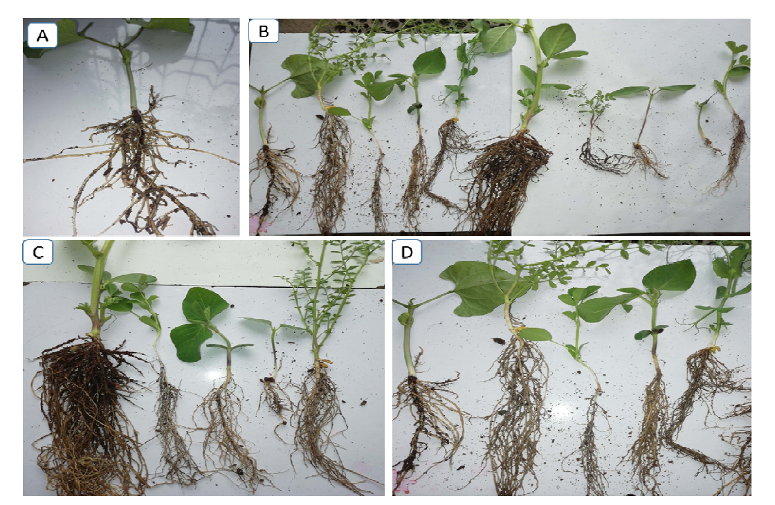
Figure 3. A – Nodulation test showing the root nodules in Lablab purpureus . B, C, D – Nodulation test under control environment shows absence of root nodules in Vigna mungo , Glycine max , Cicer arientunum , Pisum sativum , Vicia faba , Trigonella foenugraecum , Vigna unguiculata , Lablab purpues , Phaseoulus vulgaris .