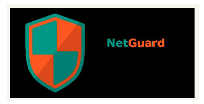
Figure 3. Net Guard Application

The number continues to increase, 77 million users in 2016 and 50 million in 2017 in the Netherlands and America. In Indonesia, the use of adblocker or ad-blocking software has also been used independently by internet users. Some ad blocking software often used include Adway works by sending advertisements to other places to not appear on the smartphone screen. Adblockplus, an ad-blocking application, has functioned as a web traffic filter. Adblock browser works to block all advertisements that appear when internet users are browsing. DNS66 is a simple application that will block all advertisements on the internet. This application net guard helps secure the device from viruses and saves data.