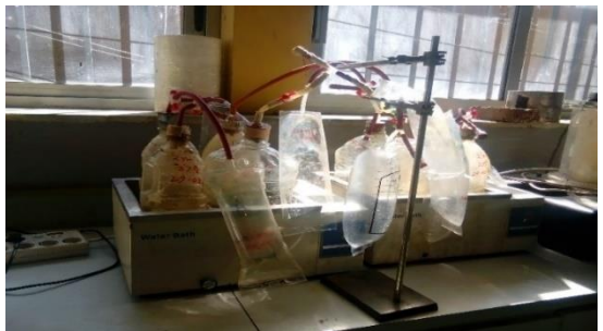
Figure 1. Expermental setup

The experimental set up for the study on batch digestion consists of plastic bottle with a plastic stopper (Figure 1). All the eight anaerobic digesters were constructed in bench-scale experiments at which the degradation of the substrate was accomplished in sealed plastic bottles with a capacity of 3 liters in Addis Ababa institute of technology (AAiT) Environmental Engineering laboratory. Each bottle was sealed with a rubber stopper having one outlets. The outlet was attached to the branched connector one branch connect to plastic air bag and the other one is closed and it is used to measure the volume collected gas. Manual agitation was take place by shacking the digester by hand in each day. There were eight (8) treatments T1 (<1-year cactus at 27°C), T2 (<1-year cactus at 37°C), T3 (1-year cactus at 27°C), T4 (1-year cactus at 37°C), T5 (2year cactus at 27°C), T6 (2-year cactus at 37°C), T7 (3-year cactus at 27°C) and T8 (3-year cactus at 37°C).