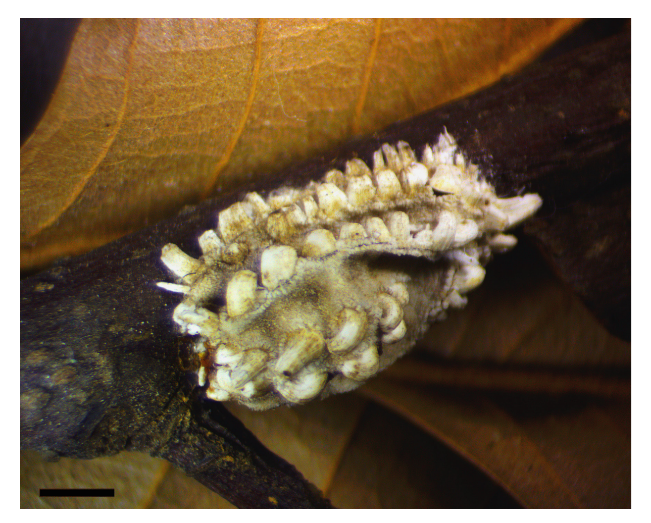
Fig. 1. Gompholopium quercicola gen et sp. nov., paratype, dry \stackrel{\bigcirc}{\rightarrow} (ZIN RAS, K 1548) on twig of host plant. Scale bar = 1 mm.