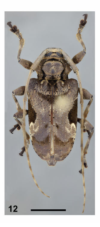
Figs 11–12. Lagocheirus araneiformis parvulus Casey, 1913. 11 . Cerambyx ypsilon from Voet (1778?). 12 . Female from Honduras (RBINS). Dorsal habitus. Scale bar = 5.0 mm.