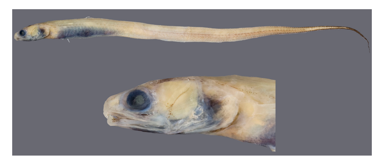
Fig 1. Echiodon prionodon sp. nov., left lateral view (holotype NMNZ P.041833, 165 mm TL).

Off White Island, outer Bay of Plenty, New Zealand, 37° 33.57'S – 176° 59.1-58.8'E, 313 m bottom trawl.