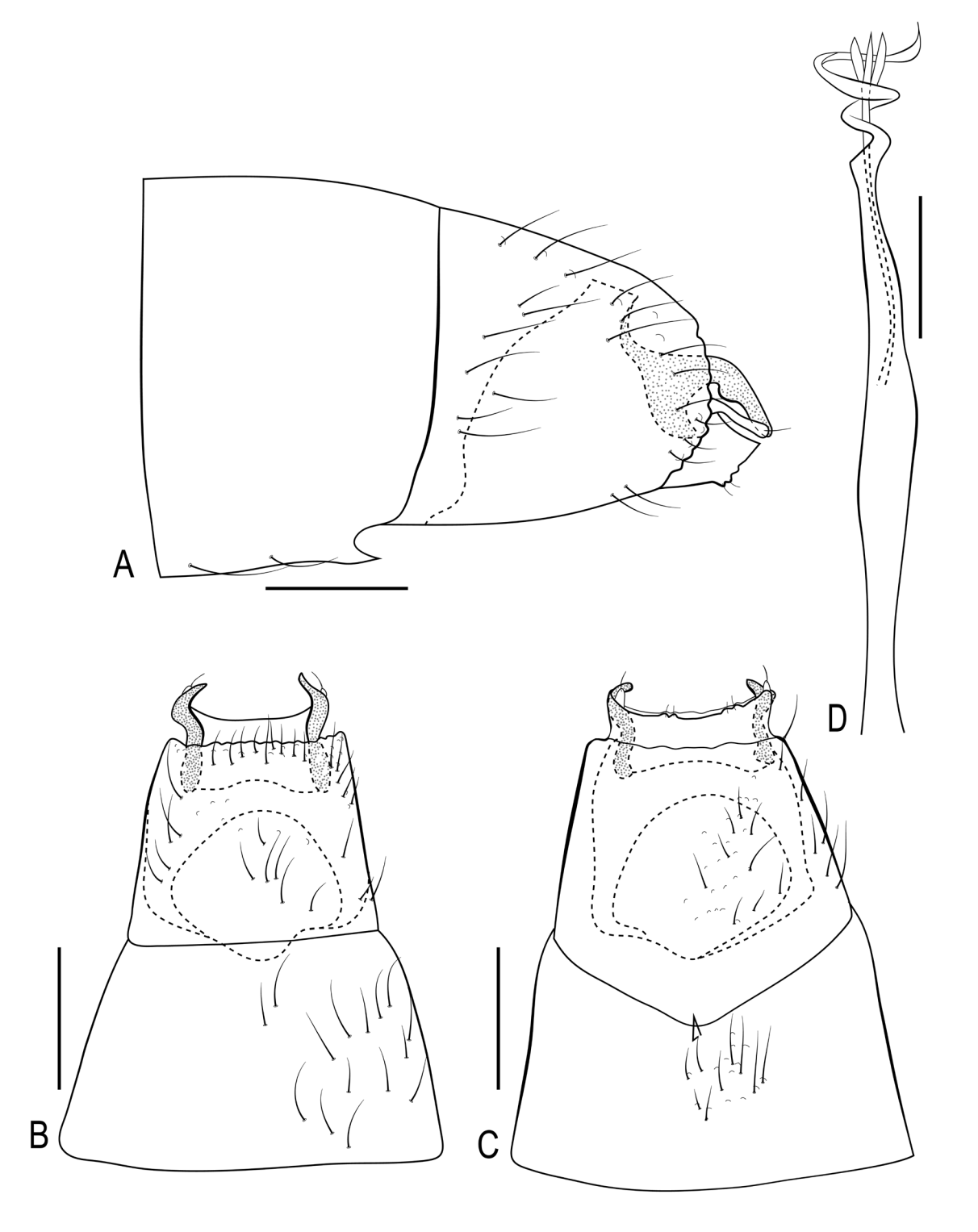
Fig. 3. Oxyethira ( Trichoglene ) spiralis sp. nov., male genitalia. A . Lateral. B . Dorsal. C . Ventral. D . Aedeagus, dorsal. Scale bars = 0.1 mm.

and O. (Trichoglene) perignonica Wells & Johanson, 2015. These species can be well localized or widely distributed in the Sud Province but are never found in the northern region (Province Nord) (Wells & Johanson 2015). Oxyethira (Trichoglene) spiralis sp. nov is only known from its type locality in the Province Nord.