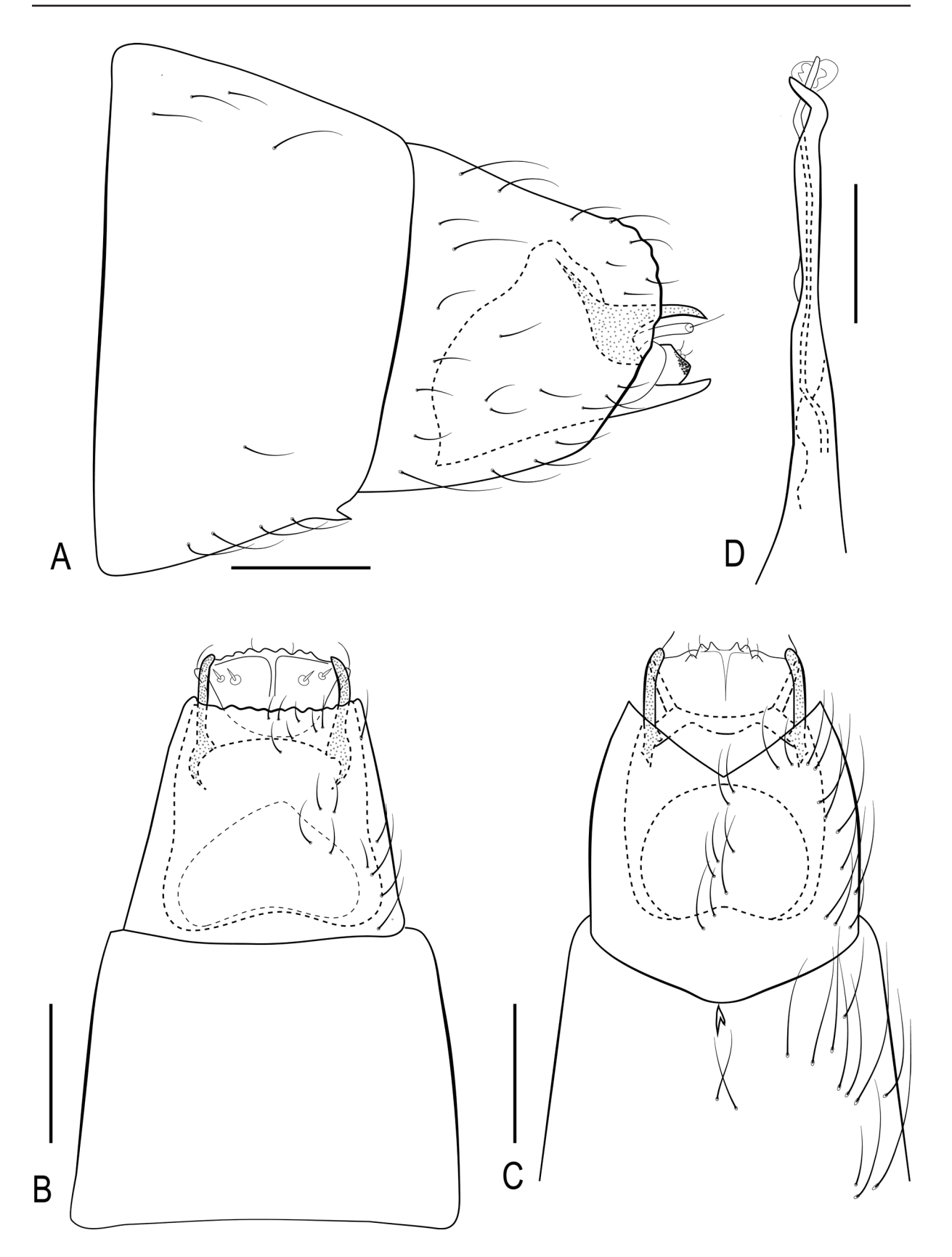
Fig. 2. Oxyethira ( Trichoglene ) rectangulata sp. nov., male genitalia. A . Lateral. B . Dorsal. C . Ventral. D . Aedeagus, dorsal. Scale bars = 0.1 mm.