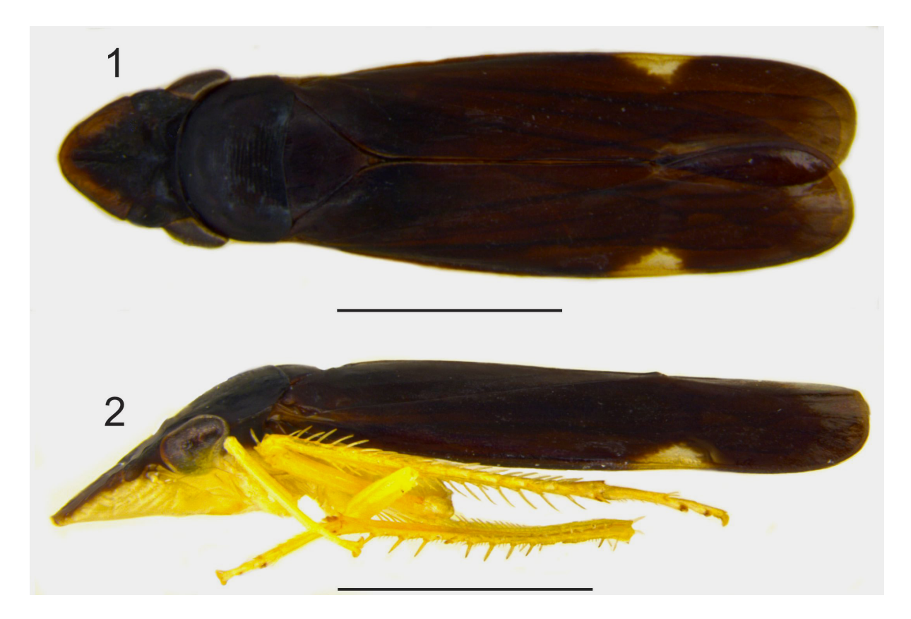
Figs 1–2. Platygonia nigra sp. nov., holotype, \stackrel{\frown}{\odot} (INPA). 1 . Body, dorsal view. 2 . Body, lateral view. Scale bars = 2 mm.

HEAD (Figs 1–2). In dorsal view, strongly produced anteriorly; median length of crown greater than interocular width and about <sup>8</sup>/<sub>10</sub> transocular width; anterior margin narrowly rounded; with distinct carina at transition from crown to face; ocelli located slightly before transverse imaginary line between anterior eye angles, each ocellus slightly closer to median line of crown than to adjacent anterior eye angle; disk depressed from ocelli to apex; with inconspicuous median longitudinal fovea; frontogenal suture extending onto crown and attaining ocellus. Antennal ledge, in dorsal view, slightly protuberant; in lateral view, with anterior margin oblique. Face with disk of frons depressed medially; muscle impressions distinct. Clypeus with profile continuing contour of frons.