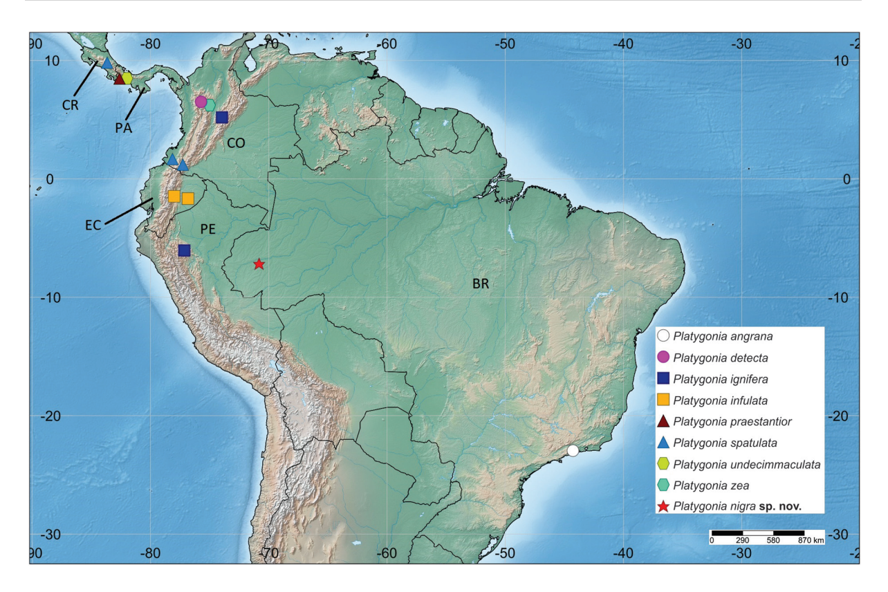
Fig. 9. Known distribution of species of Platygonia Melichar, 1925. Countries: BR = Brazil; CO = Colombia; CR = Costa Rica; EC = Ecuador; PA = Panama; PE = Peru.

This paper, along with other publications on the taxonomy of the tribes Cicadellini and Proconiini (e.g., Cavichioli & Mejdalani 2012; Silva et al. 2017, and Pecly et al. 2019), reveals that the fauna of the Cicadellinae from the Neotropical Region, especially that from the Amazon Rainforest, is still poorly known. The greater concentration of leafhopper taxonomists in Southeastern and Southern Brazil, in comparison with other regions of the country, is possibly an explanation for this problem, as well as the great difficulties for accessing various collection sites in the Amazon region. Studies of material in backlogs of scientific collections, as well as the conduction of field work in various parts of the Amazon region, will certainly result in the discovery of new interesting species and genera of the Cicadellinae and other leafhopper subfamilies.