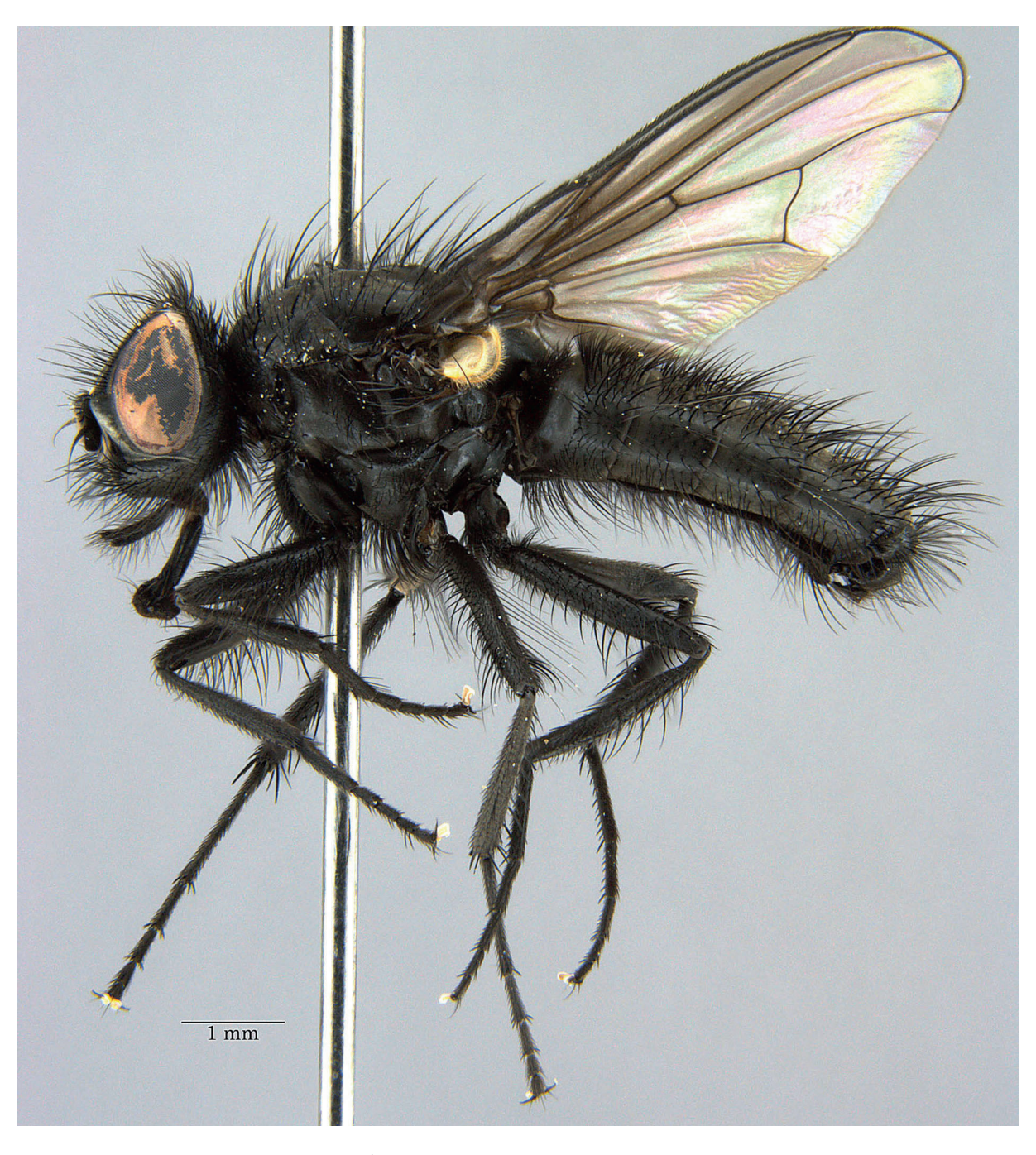
Fig. 4. Drymeia ziegleri sp. nov., \circlearrowleft , holotype (ZMHU), lateral view.