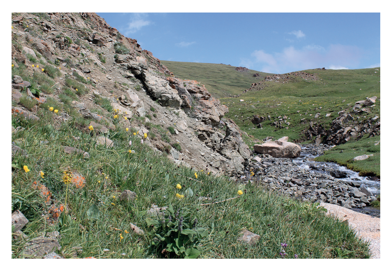
Fig. 5. The type-locality of Drymeia ziegleri sp. nov. (Kyrgyzstan, Kalmak-Anshun Pass).

HEAD. Ground-colour black. Eye densely long-haired. Fronto-orbital plate and parafacial, face, gena and lower occiput brownish-grey pruinose. Fronto-orbital plates not touching, separated by a narrow frontal vitta. Frons at narrowest point 3 \times as wide as diameter of anterior ocellus. 16-18 pairs of frontal setae, including interstitials, reaching almost to anterior ocellus. Antenna black, postpedicel 1.5 \times as long as wide. Arista appearing almost bare, longest hairs much shorter than its basal diameter. Parafacial at level of insertion of arista slightly wider than or equal to width of postpedicel, hardly narrowing below. In lateral view, lower facial margin not projecting forward beyond level of antennal base. Gena broad,