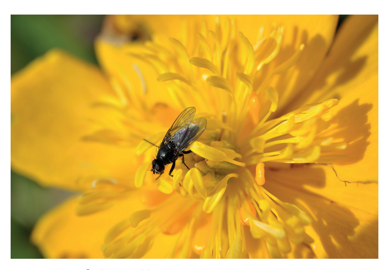
Fig. 1. Drymeia sp., ♀.