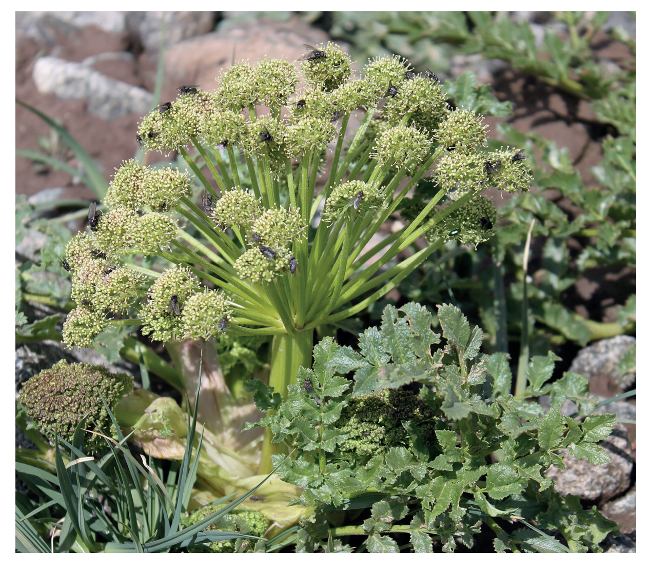
Fig. 2. Angelica brevicaulis (Rupr.) covered with muscoid flies at Kalmak-Anshun Pass, Kyrgyzstan.

Specimens were examined using an Altami PSO745-T microscope for external morphological features. Illustrations were made with a Canon EOS 600D camera mounted on a Zeiss Stemi 2000-C stereo microscope and processed using Adobe Photoshop CS.