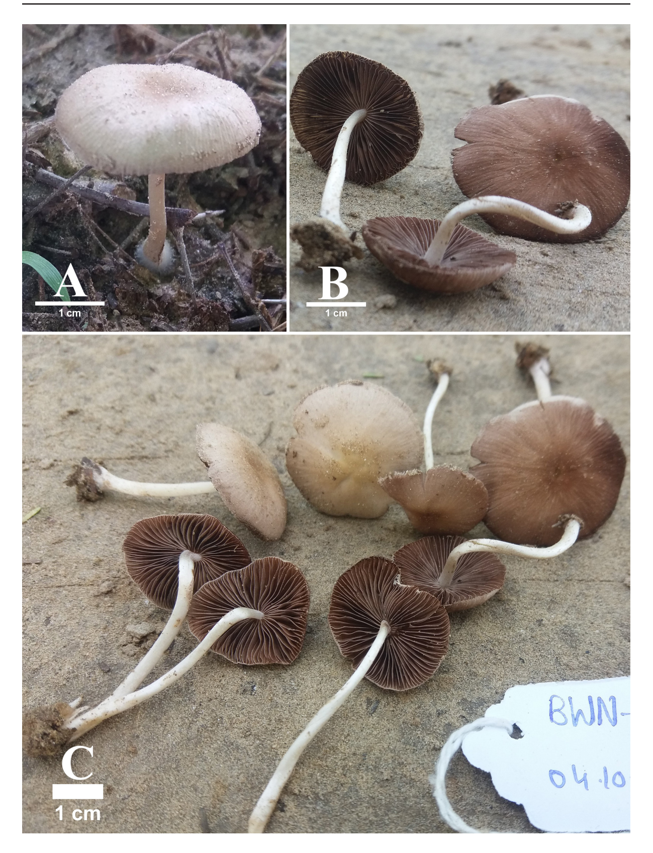
Fig. 2. Candolleomyces asiaticus M.Asif, A.Izhar, Niazi & Khalid sp. nov., holotype (LAH36809). Basidiomata.