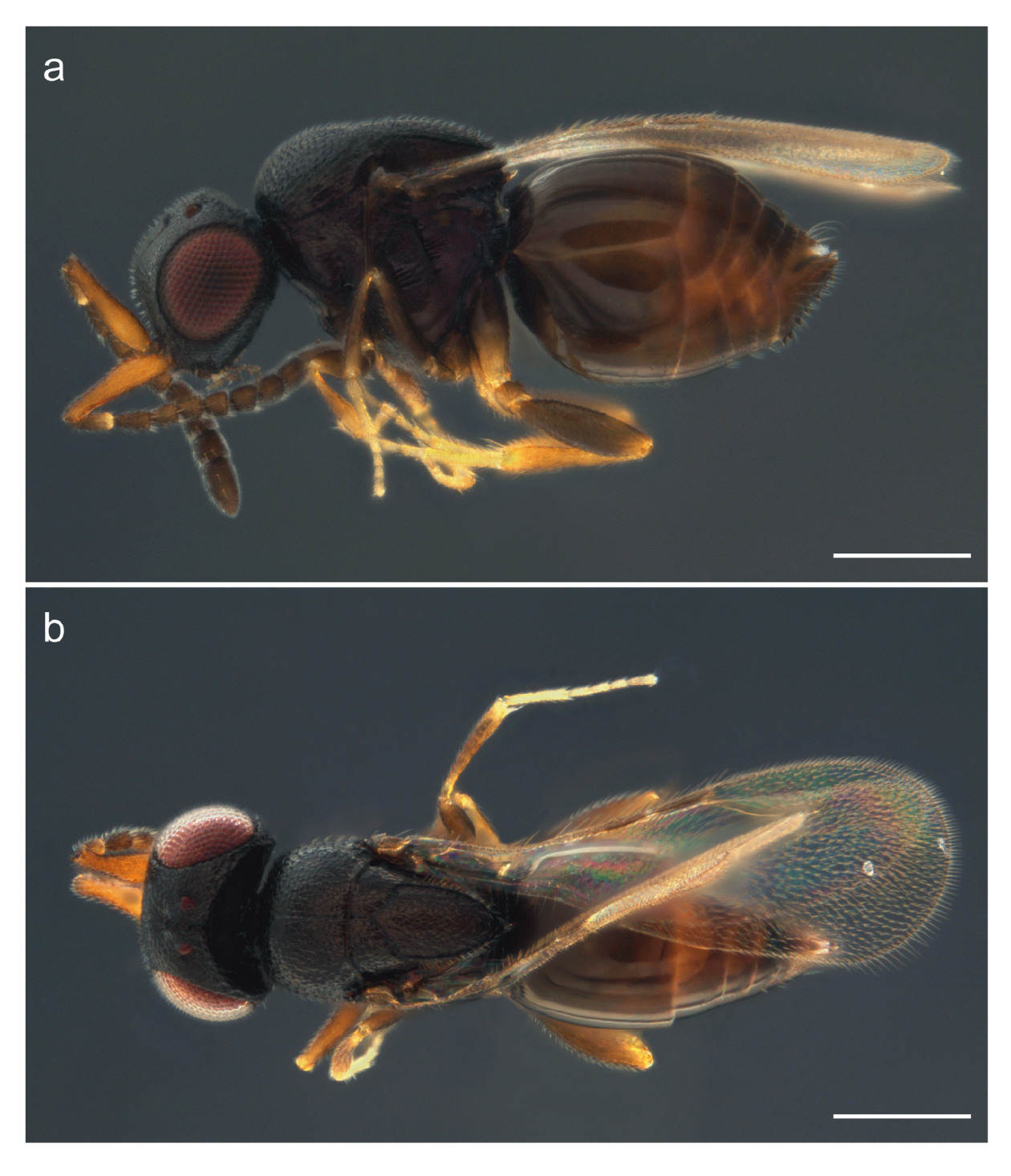
Fig. 1. Aphanogmus kretschmanni Moser sp. nov.; holotype, \cite{} (SMNS_Hym_Cer_000227). a . Habitus, lateral view. b . Habitus, dorsal view. Scale bars = 200 μm.

Preocellar pit present. Anterior ocellar fovea extended ventrally into short facial sulcus reaching dorsal margin of frontal depression. Antennal scrobe present, ventrally delimited by intertorular carina. Clypeus convex and rectangular (1.5 times as broad as high). Supraclypeal depression, subtorular carina, carina delimiting antennal scrobe, frontal ledge and subantennal groove absent. Mandibles with two distinct teeth, without mandibular lancea. Mandible slender, length along ventral edge 3.3 times as long as height of mandible measured in the middle of its length. Maxillae with four palpomeres.