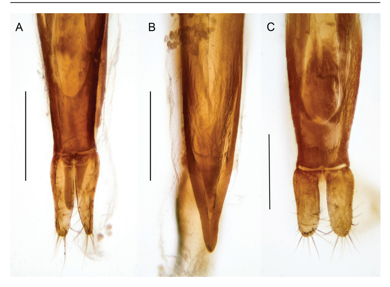
Fig. 14. Bolianus giannae gen. et sp. nov. A–B . Holotype, detail of aedeagus. A . Parameres, ventral view. B . Median lobe, dorsal view. – C . Paratype, parameres, ventral view. Scale bars = 0.2 mm.