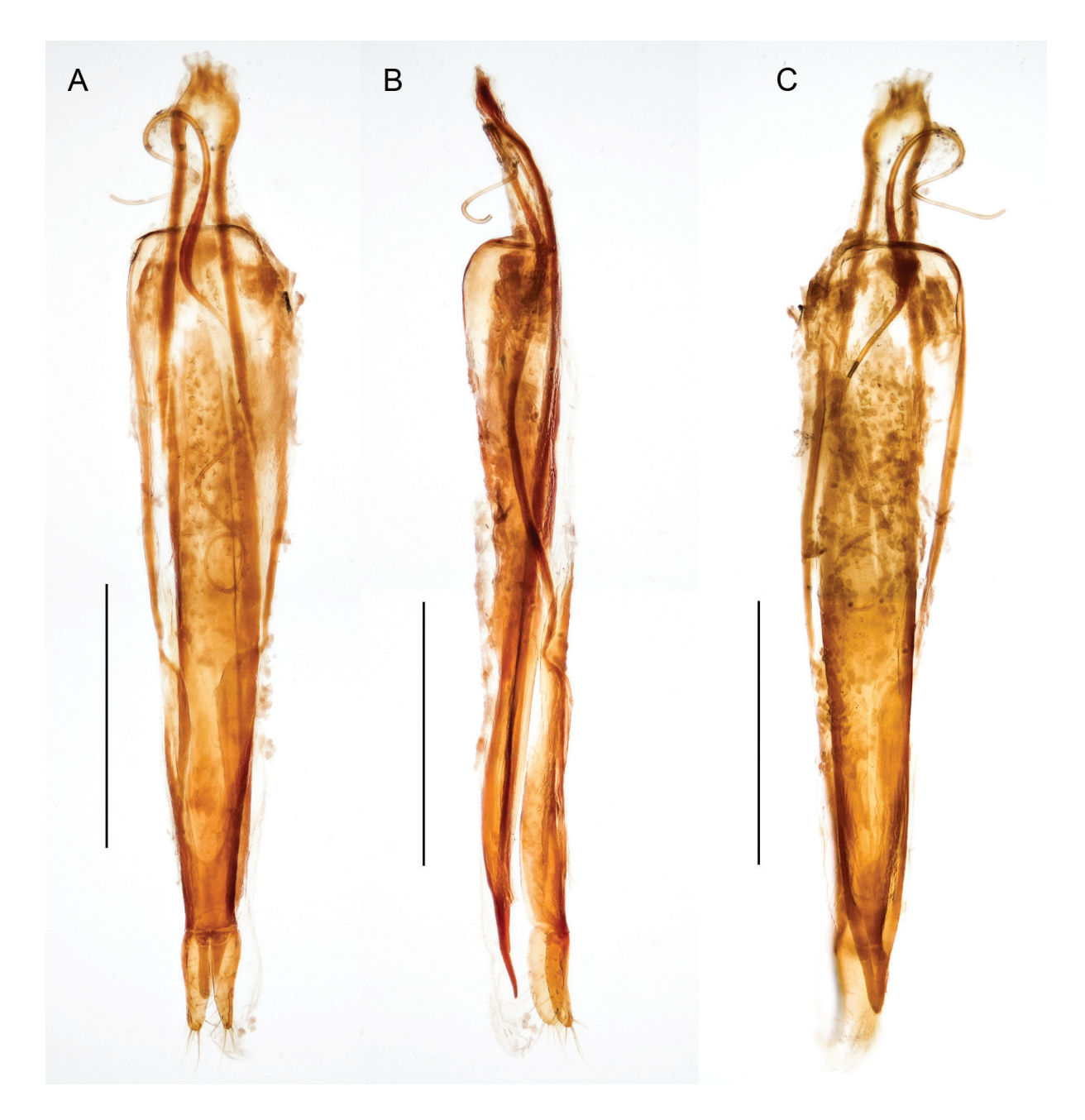
Fig. 13. Bolianus giannae gen. et sp. nov., holotype, aedeagus. A . Ventral view. B . Lateral view. C . Dorsal view. Scale bars = 0.5 mm.

Since the remaining key given by Thomas & Nearns (2008) remains unchanged, it is not reproduced here to avoid redundancy.