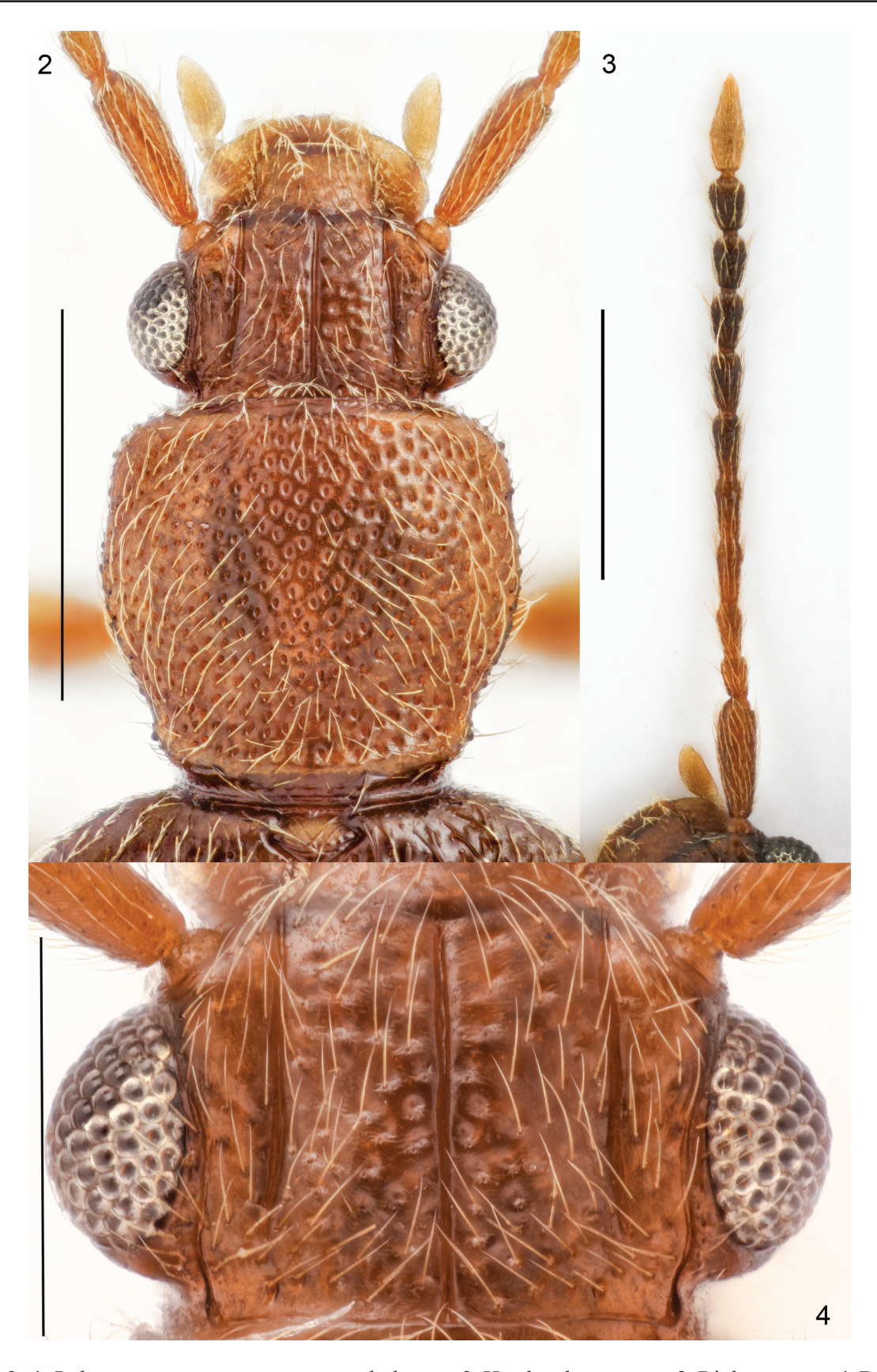
Figs 2–4. Bolianus giannae gen. et sp. nov., holotype. 2 . Head and pronotum. 3 . Right antenna. 4 . Detail of head. Scale bars: 2-3 = 1.0 mm, 4 = 0.5 mm.