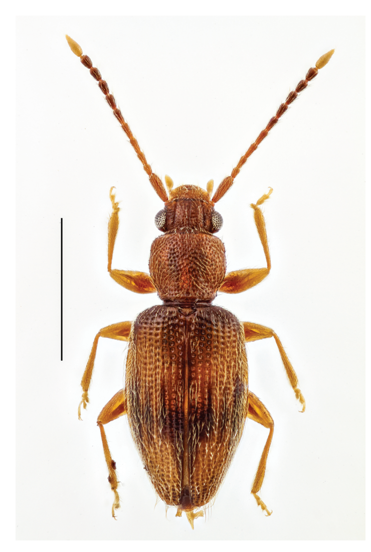
Fig. 1. Bolianus giannae gen. et sp. nov., holotype, habitus. Scale bar = 2.0 mm.

GABON: ♂, Ipassa-Makokou, 0°30'43" N, 12°48'13" E, 500 m, 25 Nov. 2013, leg. M. Pavesi (Museo di Storia Naturale di Venezia, Venice, Italy).