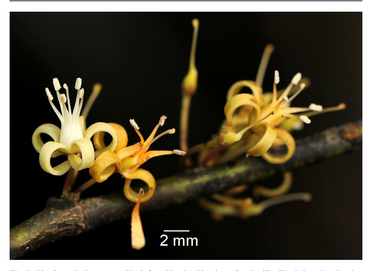
Fig. 3. Rhaphiostylis beninensis (Hook.f. ex Planch.) Planch. ex Benth., like Fig. 2, but also showing ovary and style in older flowers. Photograph by Bart Wursten from Boyekoli Ebale Botany 785 (BR) from Congo Kinshasa (copyright Botanic Garden Meise).

part of Liberia, and while it is not sure that the species grows in a protected area, "Vulnerable" should be the correct status for the moment (B1 & B2 ab(iii), IUCN 2015).