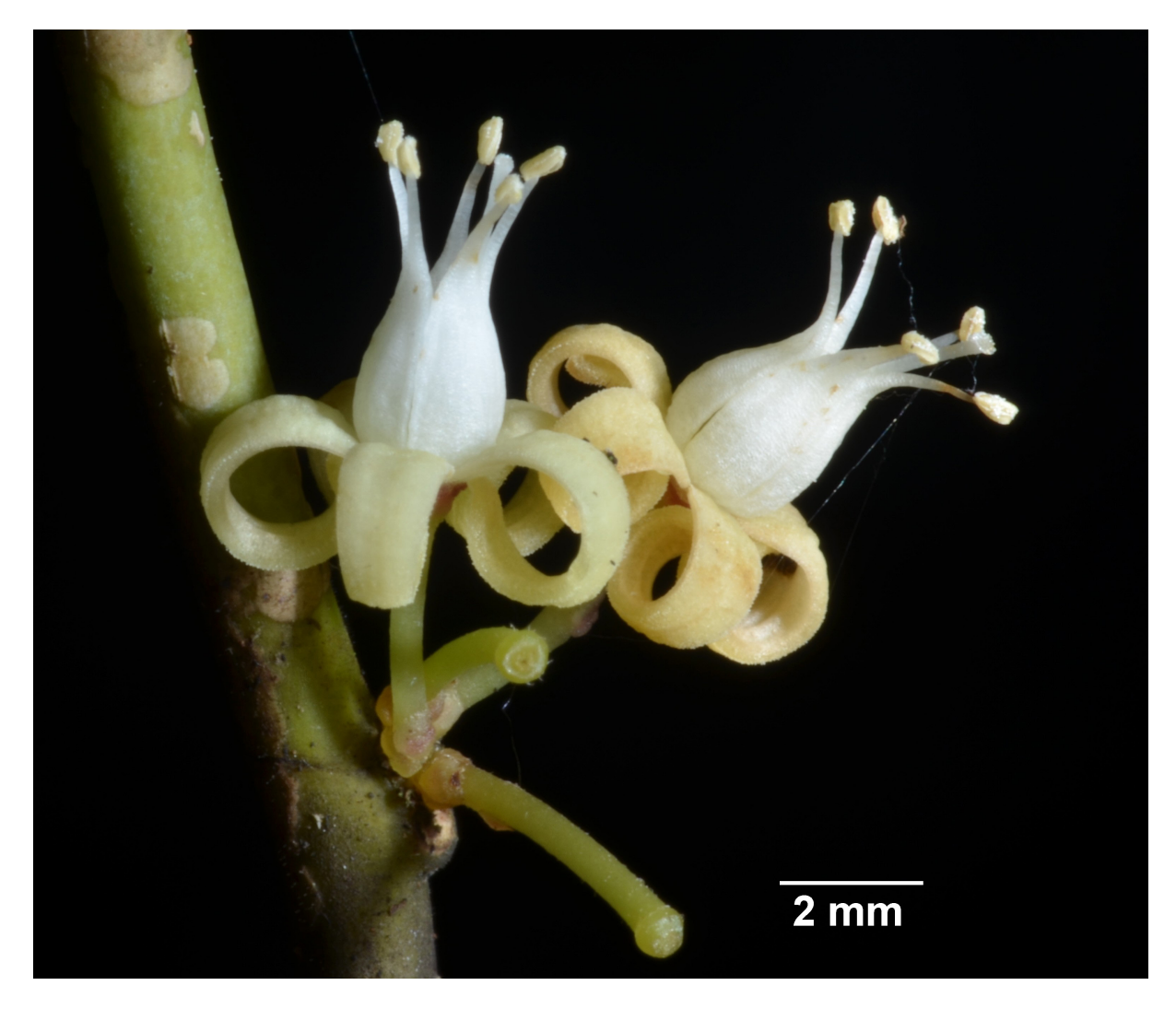
Fig. 2. Rhaphiostylis preussii Engl. showing flowers with the flattened filaments closing around the ovary while the petals are bending down. Photograph by Ehoarn Bidault (Missouri Botanical Garden) from Bidault 786 (MO) from Gabon.