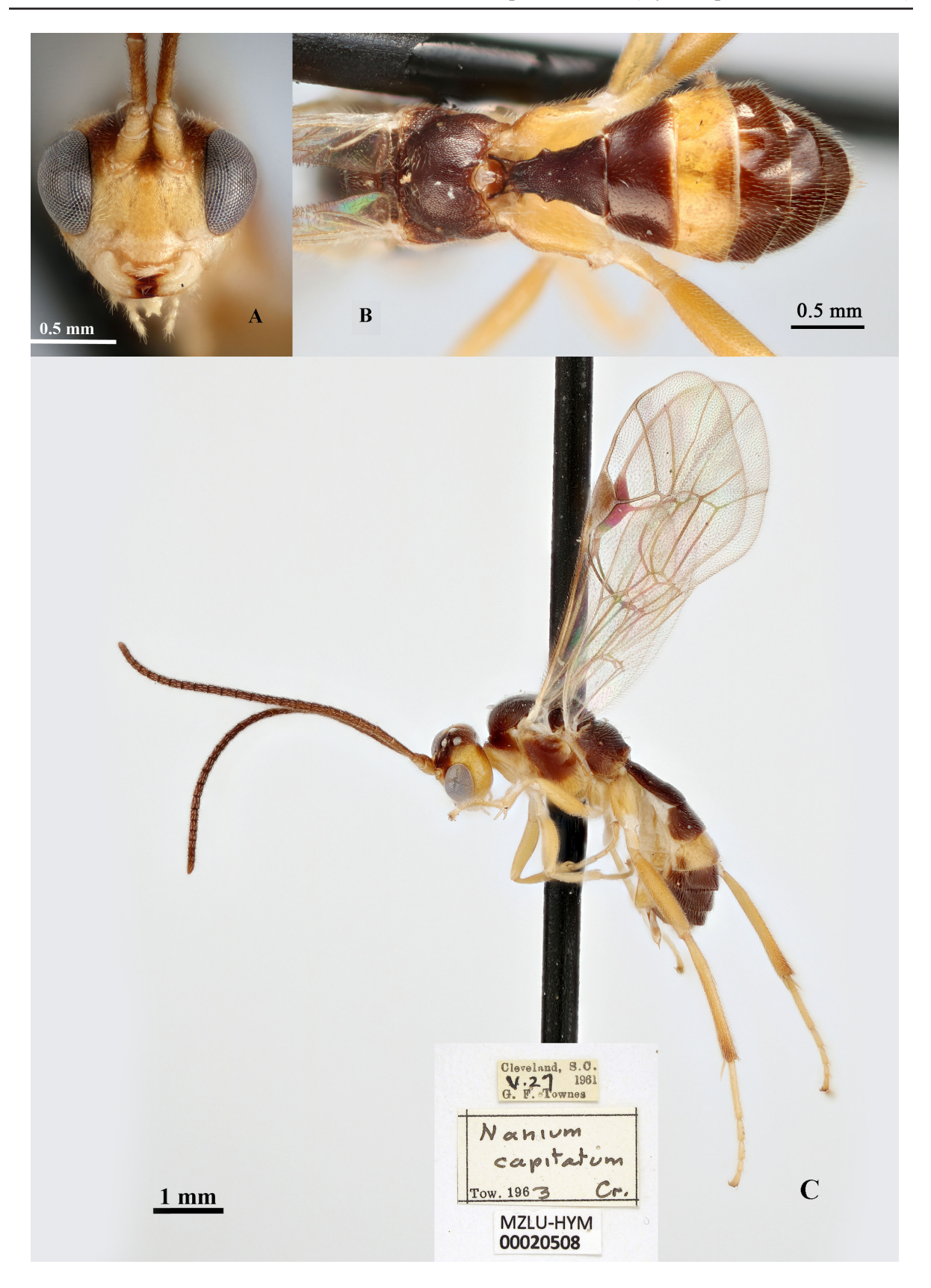
Fig. 3 . Nanium capitatum Townes, 1967, ♀ (MZLU-HYM 00020508). A . Face (frontal view). B . Metasoma (dorsal view). C . Habitus.