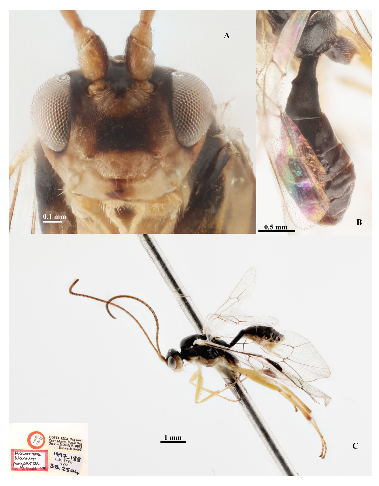
Fig. 6 . Nanium nogueri Gauld, 1997, holotype, \mathcal{P} (BMNH). A . Face. B . Metasoma (dorsal view). C . Habitus.