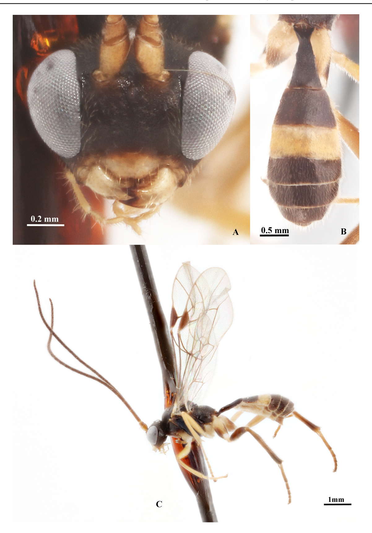
Fig. 1 . Nanium atitlanensis Reshchikov & Sääksjärvi sp. nov., holotype, ♀ (LLAMA#Ma-B-09-2-01 (ZMUT)). A . Face (frontal view). B . Metasoma (dorsal view). C . Habitus.