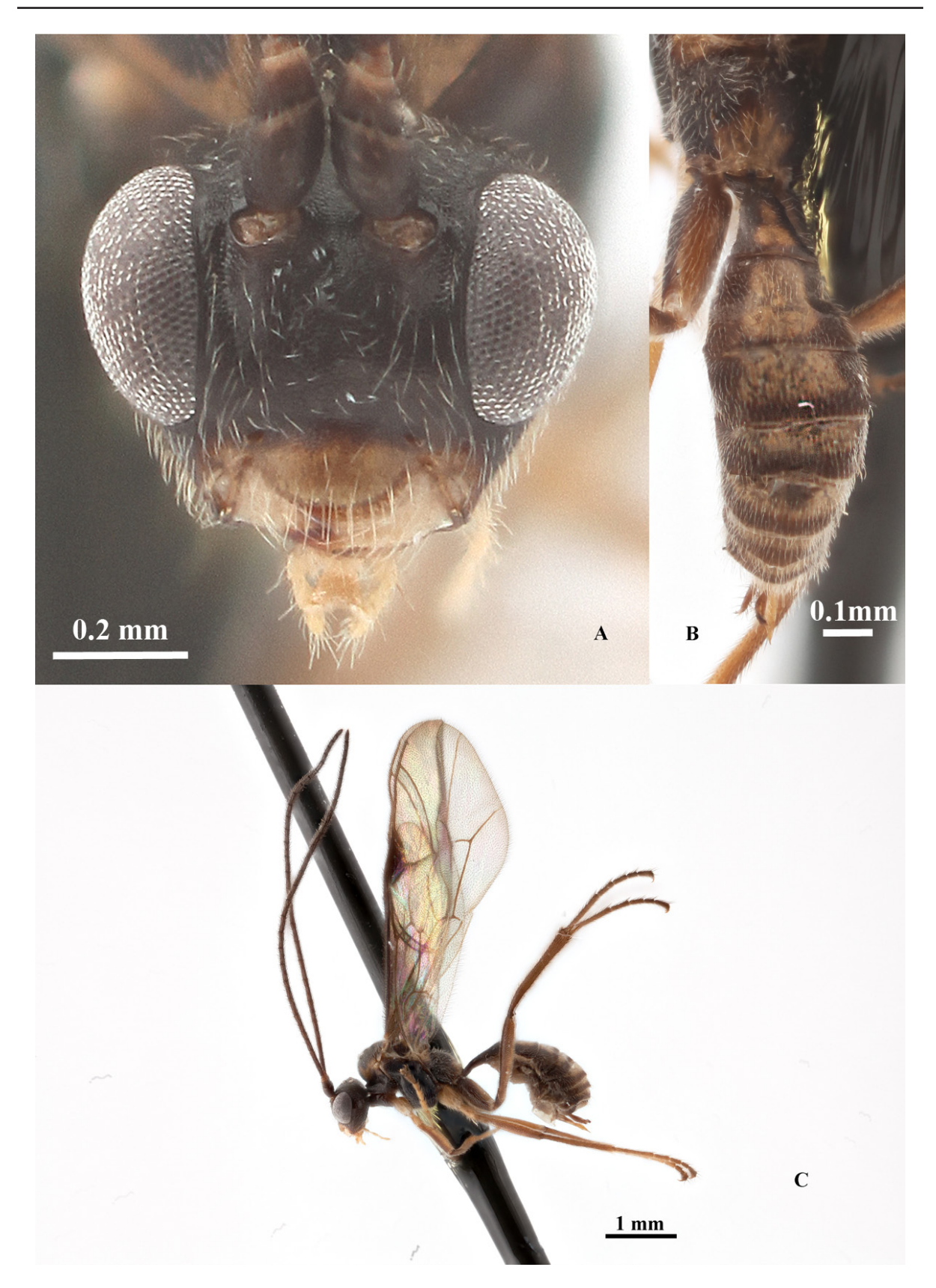
Fig. 5 . Nanium medianum Reshchikov & Sääksjärvi sp. nov., holotype, ♀ (EC/2009-37/MP&ADB-013 (RBINS)). A . Face. B . Metasoma (dorsal view). C . Habitus.