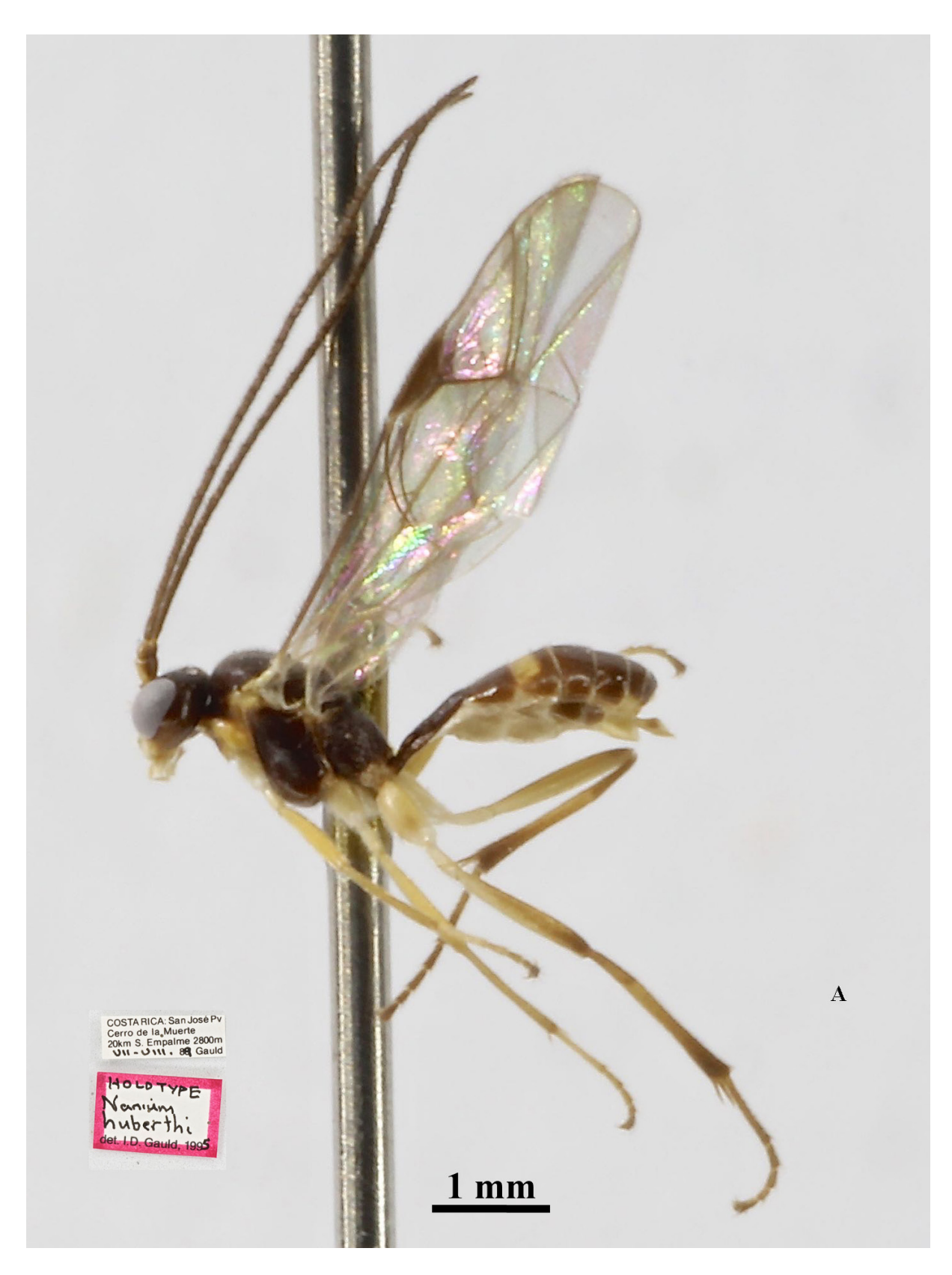
Fig. 4 . Nanium huberthi Gauld, 1997, holotype, ♀, habitus (MNCR).