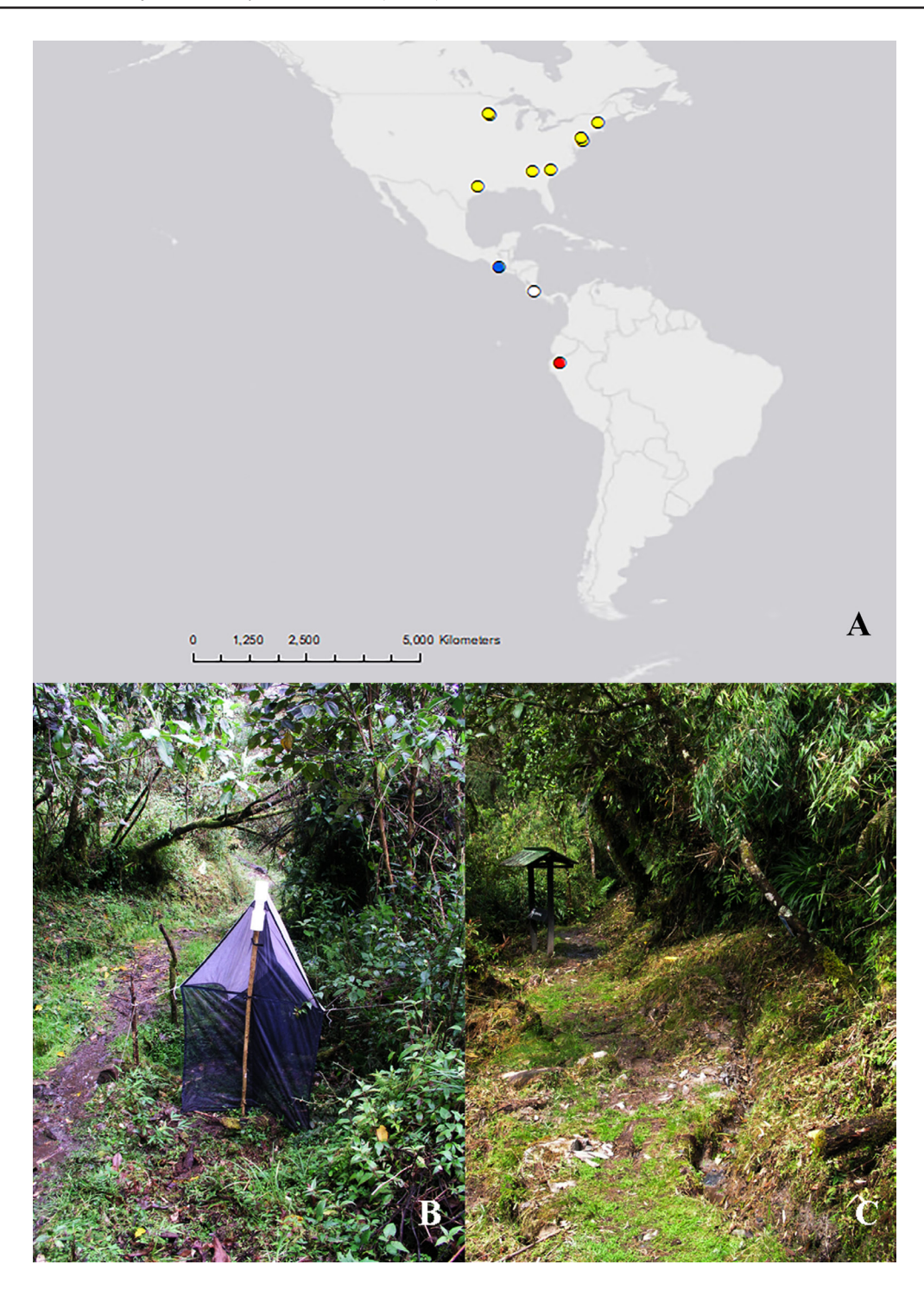
Fig. 8 . Distribution and habitats of Nanium . A . Distribution of Nanium species (blue – N. atitlanensis Reshchikov & Sääksjärvi sp. nov.; yellow – N. capitatum Townes, 1967; white – Costa Rican species ( N. huberthi Gauld, 1997, N. mairenai Gauld, 1997, N. nogueri Gauld, 1997, N. oriasi Gauld, 1997); red – N. medianum Reshchikov & Sääksjärvi sp. nov.). B . Malaise trap and type locality of N. medianum sp. nov. on the trail Bosque Nublado, Cajanuma, Podocarpus Parque Nacional, Ecuador. C . Trail Oso de Anteojos near the type locality of N. medianum sp. nov., Podocarpus Parque Nacional, Ecuador, where the paratype specimen was captured in a yellow pan trap.