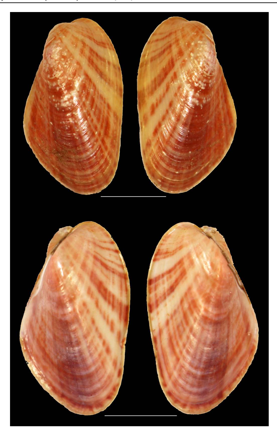
Fig. 1. Modiolus cimbricus sp. nov., holotype (shell length 13.3 mm). The upper part of the figure shows the external shell side and the lower part shows the inner side of the valves. Scale bars = 5 mm.