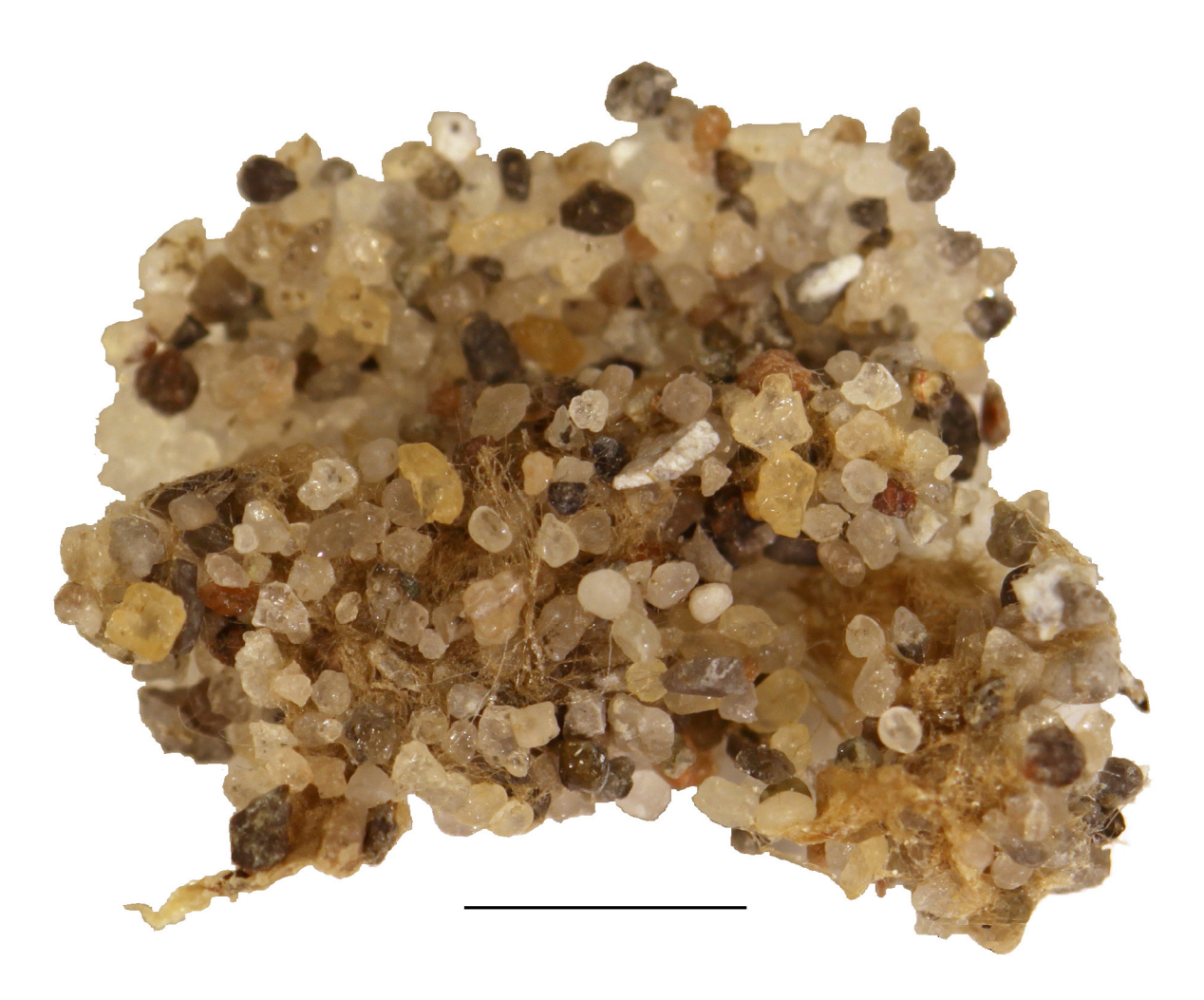
Fig. 2. Modiolus cimbricus sp. nov. A 17.5 mm long specimen in its ball of sand grains. This specimen has been cultured for five years. Scale bar = 5 mm.

A plausible hypothesis is that Modiolus cimbricus sp. nov. has evolved into a separate species after the Weichselian glaciation. It closely resembles M. adriaticus , from which it has evolved. The latter species belongs to the Lusitanian (Mediterranean) fauna that today has its northern border on the south and west coasts of the British Isles, including the Irish Sea (Ekman 1953; Hylleberg & Riis-Vestergaard 1984) (Fig. 3). This fauna is characterized by its corresponding Mediterranean-influenced water masses from the south. Today, a branch of the Gulf Stream presses towards the northwestern parts of the British Isles and the North Sea. It fills the latter with its water and results in a very stable current pattern because it is determined by sufficient water depth that allows for three amphidromic points in the North Sea (Dietrich 1963; Jelgersma 1979; Lund-Hansen et al. 1994; see also below). Consequently, the edge