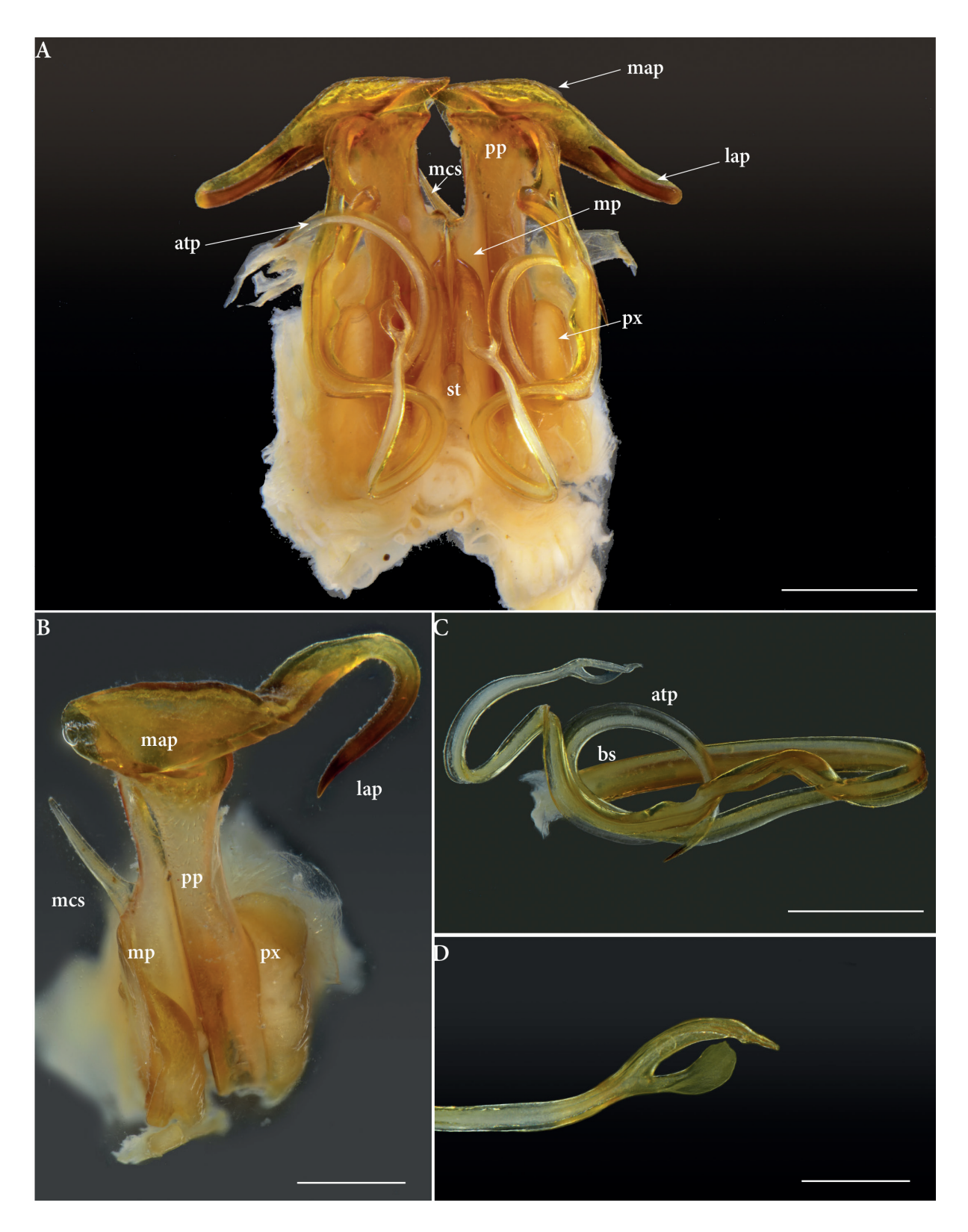
Fig. 4. Attemsostreptus reflexus sp. nov., male holotype (NHMD607065), gonopods. A. Gonopods, anterior view. B. Right gonopod, antero-apical view. C. Telopodite. D. Tip of telopodite. For abbreviations, see Material and methods. Scale bars: A = 1 mm; B-D = 0.5 mm.