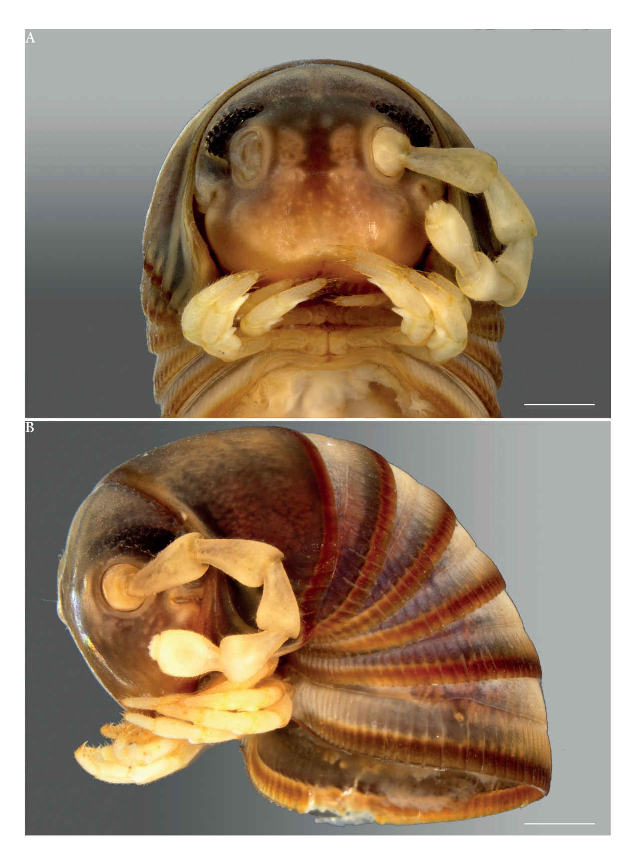
Fig. 2. Attemsostreptus reflexus sp. nov., male holotype (NHMD607065), head and anteriormost body rings. A . Ventral view. B . Lateral view. Scale bar: 1 mm.