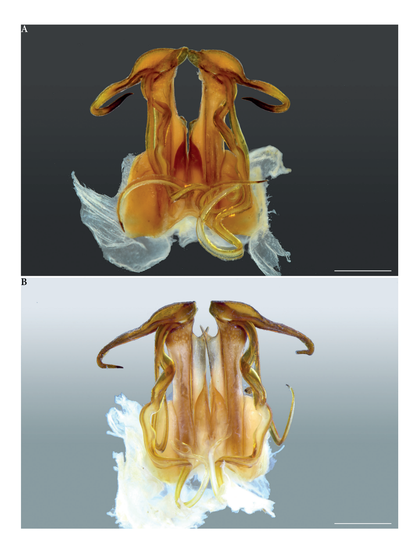
Fig. 5. Attemsostreptus reflexus , males without locality data. A. \Diamond , (NHMD621669). B. \Diamond , deviating gonopods (HNHM diplo-1697). Scale bar: 1 mm.