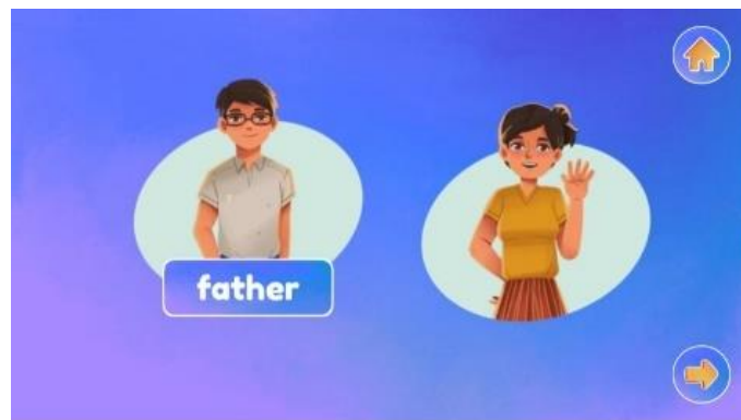
Figure 6. Vocab display

The story menu features an illustrated story equipped with audio. The purpose of the story is to introduce vocabulary in the form of sentences so that children know the concept of words.