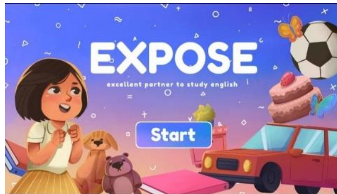
Figure 2. Opening page

the scope of English. This step is the stage of producing predetermined application. The following are examples of activities offered by 'expose'.