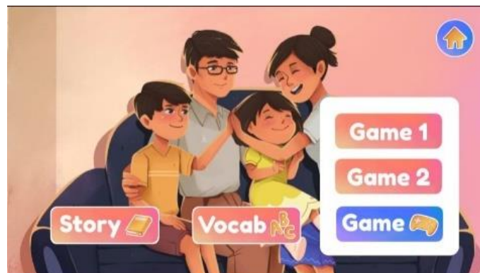
Figure 4. Menu page

This theme page consists of several themes that can be chosen by the child. The purpose of this theme page is variations so that children do not get bored with a theme. The given theme has an equivalent level of difficulty and is not tiered. This is in accordance with the original purpose, namely as a medium for introducing English vocabulary, so that all vocabulary selected in the theme is an easy vocabulary and close to the child. In one theme there will be stories, vocabs, and games.