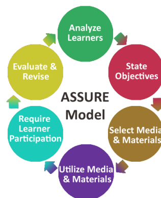
Figure 1. ASSURE model concept