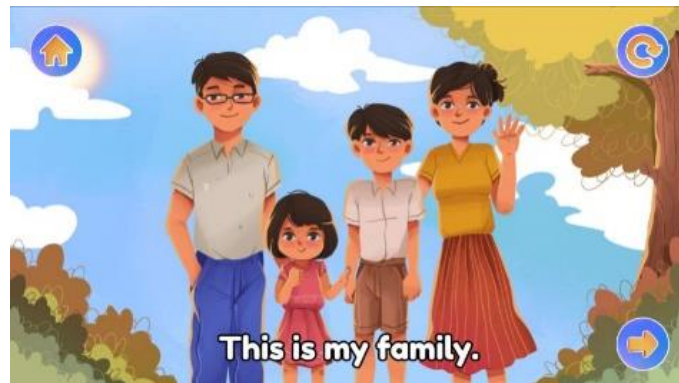
Figure 5. Story display

This menu page displays a selection of activities contained in one theme, namely story, vocab, games.