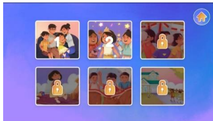
Figure 3. Theme page

The opening page on this Expose application as the initial display to start with the 'start' button then continued with the theme menu.