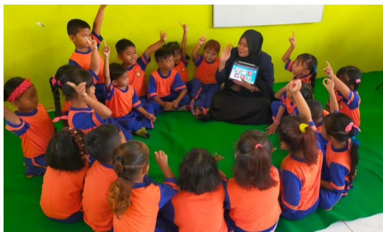
Figure 8. Expose application trial.

Documentation of the expose application trial with 20 children.