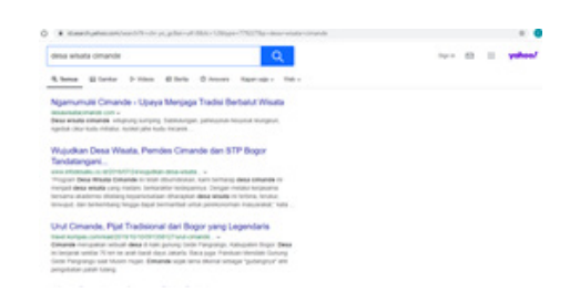
Figure 2. Search engine by Yahoo