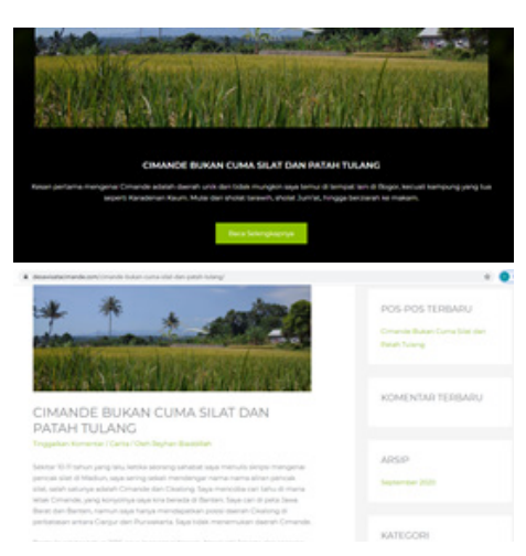
Figure 4. Links on the website (internal links)

hierarchy structure is used to connect the pages on the website. Thus the explanation related to the link is an explanation about the tour in Cimande Village itself.