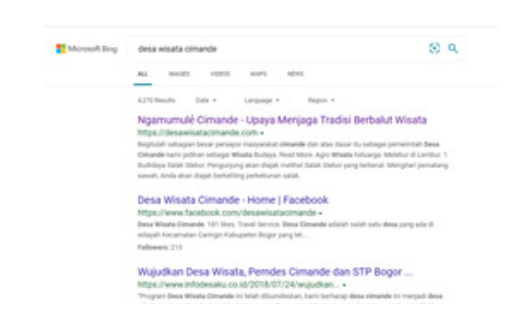
Figure 3. Search engine by Bing

Basically a lot of ways are done so that website managers can put their website at the top of the rankings. In Handayani, Febriyanto and Shofwatullah (2019) revealed that the implementation of Search Engine Optimization (SEO) can improve search engine results pages (SERP) websites in search engines, the volume and quality of traffic visits from google search engines by