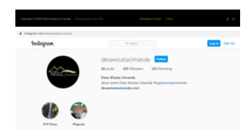
Figure 5. Links on the website (internal links)

On cimande tourism village website some links do not work properly. This is because of the incomplete information provided so that when the link is clicked access to the link is not available. Thus the repair of the link and its structure should and should be repaired or updated.