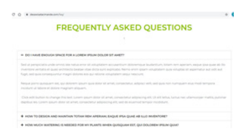
Figure 7. Website FAQ page

On the website there is also a question and answer page or better known as Frequently Asked Question (FAQ). However, this page is not well populated so the page found is a Q&A in a foreign language. In other words, the FAQ page is still the original version of the system and has not been changed by the manager. Other indicators of online PR are the news section, chat forums and online polls not found on the website of Cimande Tourism Village.