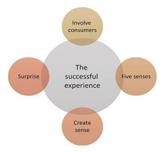
Figure 2. The key experience components

issues studied in this paper in understanding how the experiential marketing concept is involved in the two four-star hotel actors digital marketing and e-commerce channels, in particular, their social media and websites.