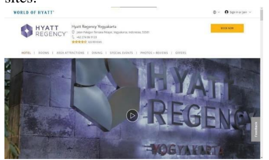
https://www.hyatt.com/en-US/hotel/indonesia/hyatt- regencyyogyakarta/yogya?src=corp_lclb_gmb_seo_yog ya

Hyatt Regency and Manohara Hotel Websites: