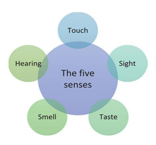
Figure 1. The five human senses

Sensory marketing has emerged as a tool to build a positive brand image and customer loyalty and experience as five senses of customer; visual, auditory, olfactory, tactile, and gustative are stimulated (Spies, Hesse, and Loesch, 1997).