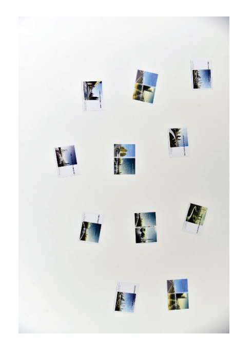
Image 3. The image shows the postcards designed for the project named "The Path of Changes' by Erna Preljevic.

Zeynep Nihan Yılmaz in her children's audiobook named "Futuristic Mushroom Houses" (image 4) reimagined the part of Sarajevo Canton, Sokolovic Kolonija, a neighborhood characterized by dull and uniform houses, using pneumatic architecture to inflate the façades and give them a convex, mushroom-like appearance, drawing inspiration from the styles of