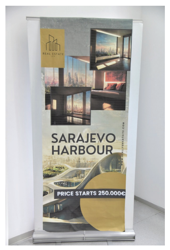
Image 8 . The display of the real estate agency "EH" promotion by Ermin Halicevic.

The overall goal of the project "Real Estate EH" by Ermin Halicevic was to demonstrate how AI can be used to create and generate ideas for a wide range of projects. In Ermin's case, it inspires him to develop futuristic Sarajevo designs and 3D models. The project's premise is the real estate agency EH (Ermin Halilcevic) (image 8), which sells apartments in Sarajevo.