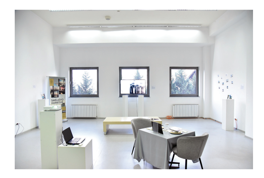
Image 1 . The image shows the interior of the exhibition "I Dream, Therefore I am Architect.

the exhibition itself becomes architecture. This exhibition functioned as a hybrid performance of architectural thoughts displayed non-traditionally to provoke the audience to think not just about the concerns and topics of projects but about architecture as playfully, creative, and witty. The traditional way of presenting was rearranged into the embodiment of a parallel world displaying multiple ideas, juxtapositions, sounds, and visuals of students' ideas through the lenses of a cooking book, restaurant's menu, futuristic voyages via google maps, videos, or postcards, or children' video book (image 1). All projects in the show envision a world where citizens will live in an integrated, imaginative, and even immersive environment.