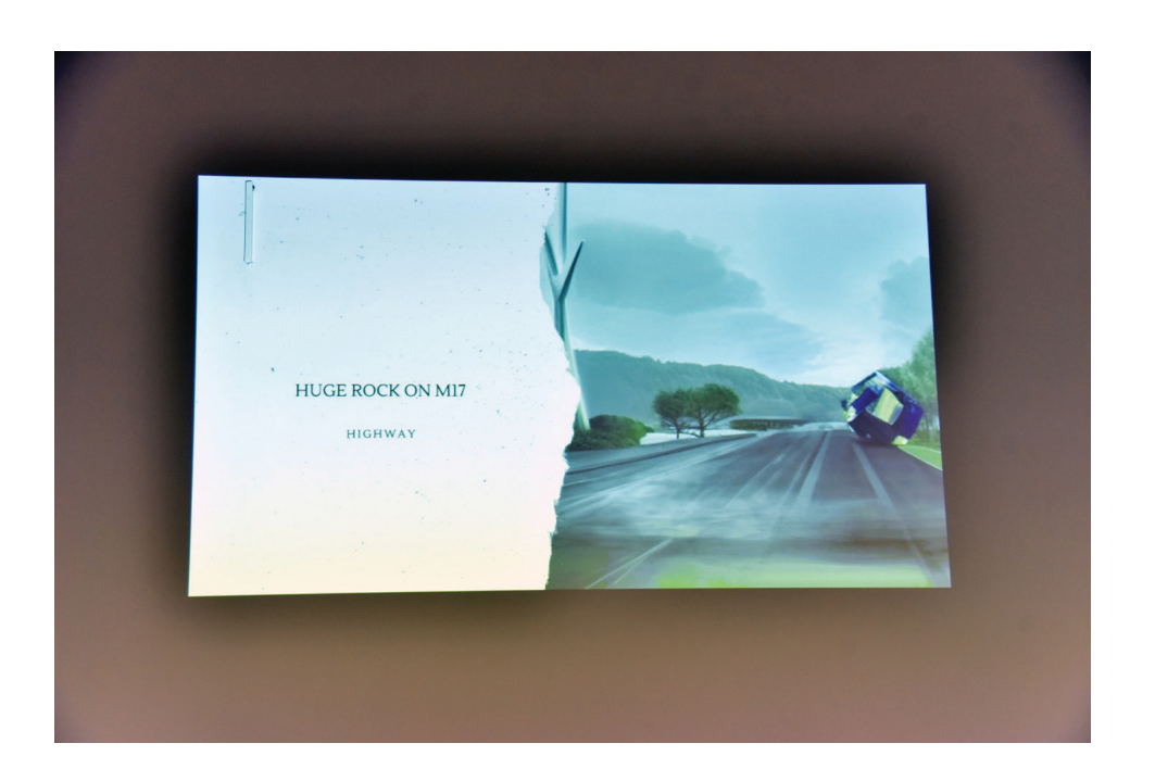
Image 2 . The image shows the envisioned world named "Picturesque Collage" by Bakir Tanovic.

The project aim of "Picturesque Collage" (image 2) by Bakir Tanovic was to show through graphic illustration and morphosis the way from his home to the university. Through this picturesque collage, he expressed his feelings