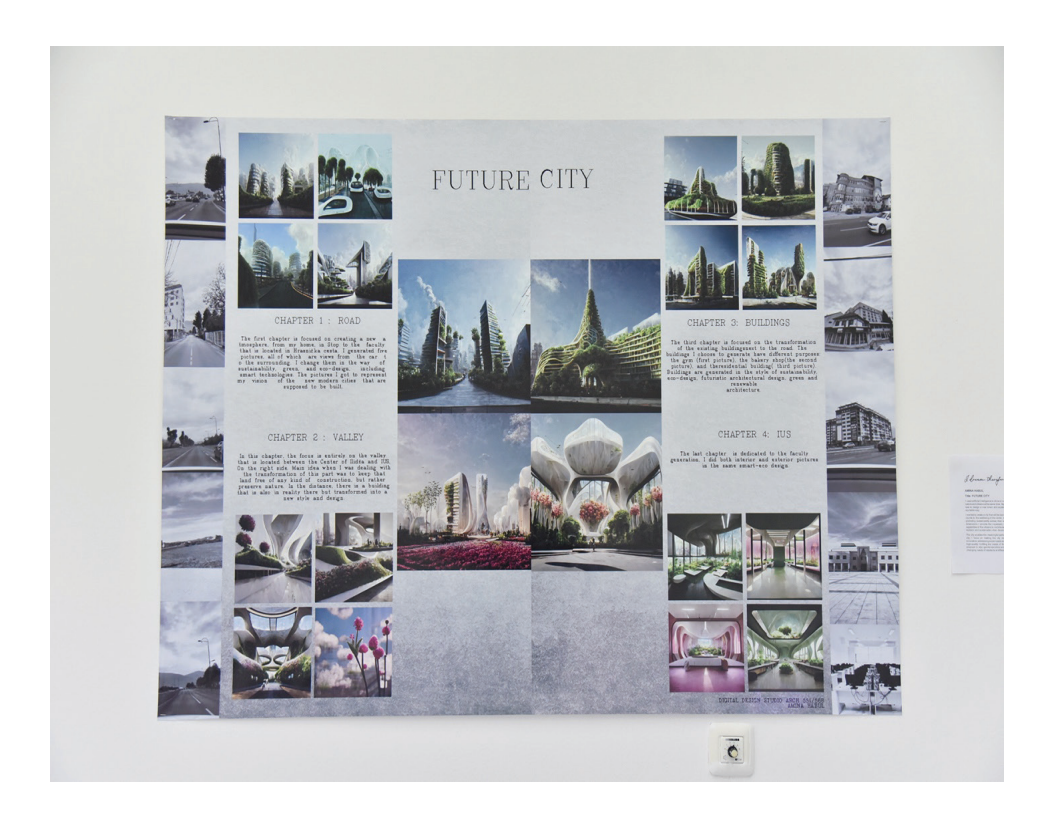
Image 7. The view of "Future City" by Amina Habul.

The overall goal of the project "Real Estate EH" by Ermin Halicevic was to demonstrate how AI can be used to create and generate ideas for a wide range of projects. In Ermin's case, it inspires him to develop futuristic Sarajevo designs and 3D models. The project's premise is the real estate agency EH (Ermin Halilcevic) (image 8), which sells apartments in Sarajevo.