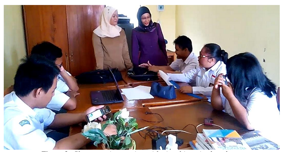
Figure 3. Classroom interaction with visual impaired students.

When teaching and learning English, the teacher and students worked out various ways of communicating with one another. In the classroom, the students could not rely on Therefore, communication visual cues. through spoken language became important. For an example, Students NK and ST, often said repeatedly to each other during learning new words. And Teacher AC, often tried to help them to pronounce and communicate the new words among them and other students in the classroom intensively by tapping their shoulders. She believed that this act of tapping gesture can stimulate the students' active participation.