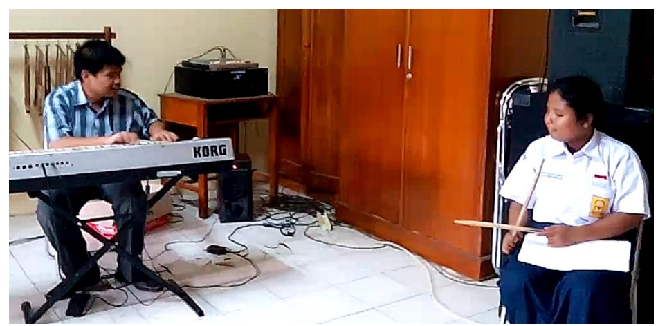
Figure 5. Musical learning for visual impaired students.

For Teachers EK, AC and MT, a Braille text book should not be ruled out as a resource in the school for visually impaired students. Although students can learn English without the aid of Braille text, it should be still considered as a necessary skill for teaching students with visual