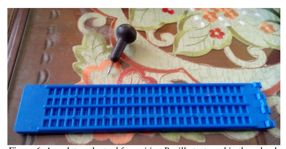
Figure 6. A reglet as the tool for writing Braille text used in the school.

impairment. Therefore, they believed that it was compulsory to teach the students how to read and write Braille text (see Bozic & McCall, 2007). Figure 6 illustrates a reglet, the tool for writing Braille text, used in the school for visual impaired students.