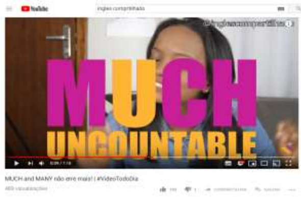
Figure 4. Inglês Compartilhado's video about quantifiers