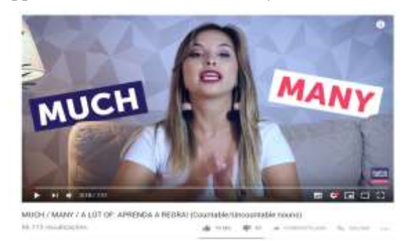
Figure 2. English in Brazil's video about quantifiers

Carina starts the lesson by saying that "much" and "many" have the meaning of "a large amount of something" in many contexts. The fact that she explains it orally gives evidence that the grammar approach is deductive (Thornbury, 1999).