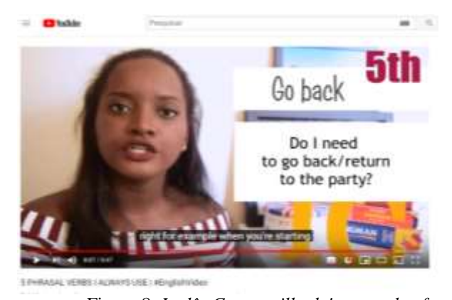
Figure 8. Inglês Compartilhado's example of phrasal verbs' meaning

She addressed the meaning by providing its meaning with an alternative word. Thus, she taught a formal word that is the equivalent to the phrasal verb. An example was the phrasal verbs "get back" and "go back" that mean "to return"; but "go back" specifically means "to return to a place." As for the use, she said it was the students' choice to use one or another. Hence, she misses the opportunity to clarify the difference in formality between the phrasal verbs and words that derive from Latin.