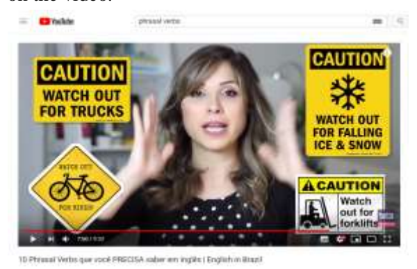
Figure 7. Pictures of signs to illustrate the phrasal verb "Watch out"

With reference to the description of the teacher's explanation, it is conclusive that her approach was deductive, since it corroborates with Thornbury (1999); she firstly introduced the topic of the video and then she explained the content, and finally provided examples. The examples were not in context excepted for the phrasal verb "watch out", where pictures of sign appear to illustrate that the verb means caution. In fact, it was the only extra technology appeared on the video.