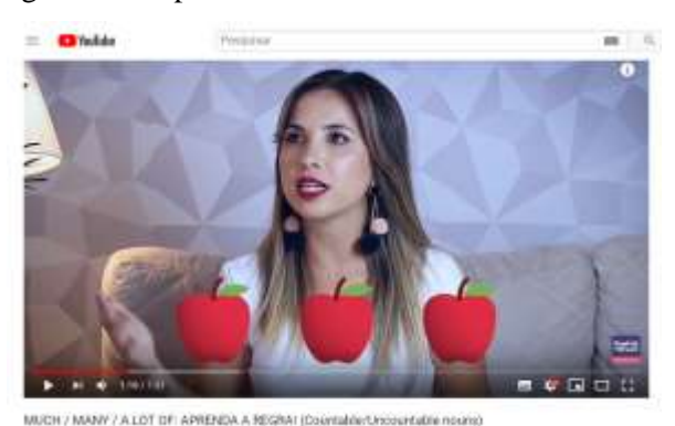
Figure 3. Animation to illustrate that the noun "apple" is countable

are countable and that it is possible to transform the noun "apple" in the plural form. By mentioning that countable nouns have the plural from, she provides important information of the grammar aspect.