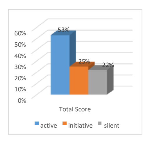
Figure 2. Students' participation of class atmosphere

The students who do not understand the material during the learning process would: 1) raise their hand and asked for more explanation was 53% can be categorized as the students active, 2) went to teacher after class to ask for more explanation was 25% can be categorized as the students initiative, and 3) did nothing was 22% can be categorized as the students silent.