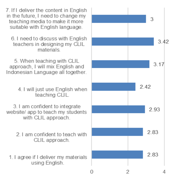
Figure 1. The teachers' perception towards their readiness and motivation to implement CLIL approach using web-based materials

Based on the data analysis, teachers were categorized as table 1 below in relation to their readiness and motivation when the CLIL and online platform were implemented in their class.