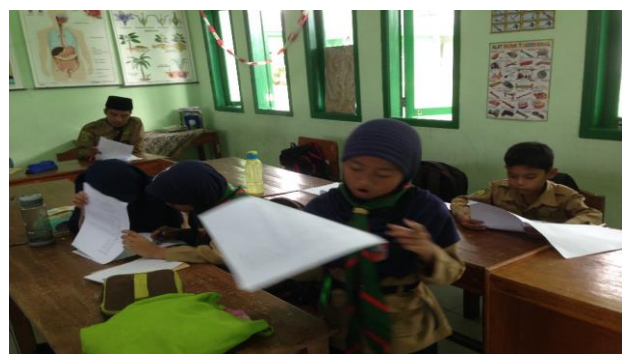
Picture 2. The students are reciting the text with the supervision of the teacher

When the teacher gets involved in the drama activity, we observed that the teacher helps the students discover the ability to explore and understand the situations. It can be useful for the students to develop creativity and communicative competence. The students' creativity in the drama activities helped the students developed their language spontaneously. The use teacher involvement also helps to prepare the students to understand self-knowledge to face real-life situations since the teacher facilitates the activities with the use of academic content and social experiences. As stated in Baldwin and Fleming (2003), creative thinking and self-knowledge can be acquired through the use of drama in education. Moreover, we find that the activities bring the students' engagement in learning situation. They engaged with the content they were learning (Picture 2).