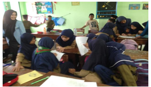
Picture 1. The students are directed by the teacher in the preparation of English drama performance

in practice, the content of the drama activities was designed based on the teachers' curricula unit.