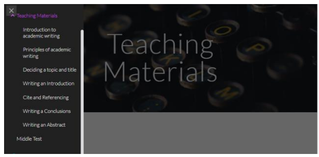
Figure 2. List of teaching materials Not only that, this platform also displays a menu of projects or tasks that have been given to students.

The developed E-learning platform of Academic Writing has attracted the attention of students in its use. This E-learning platform utilize the students' knowledge about academic writing. There several materials included in this platform such introduction of academic writing, the principles on it until the process and practices in writing. It can be seen in the following figure.