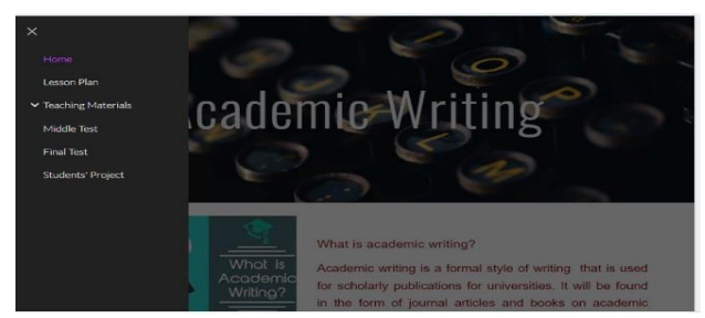
Figure 1. Home page of the entire e-learning platform.

The implementation of Google site as e-learning platform for teaching EFL during covid-19 pandemic