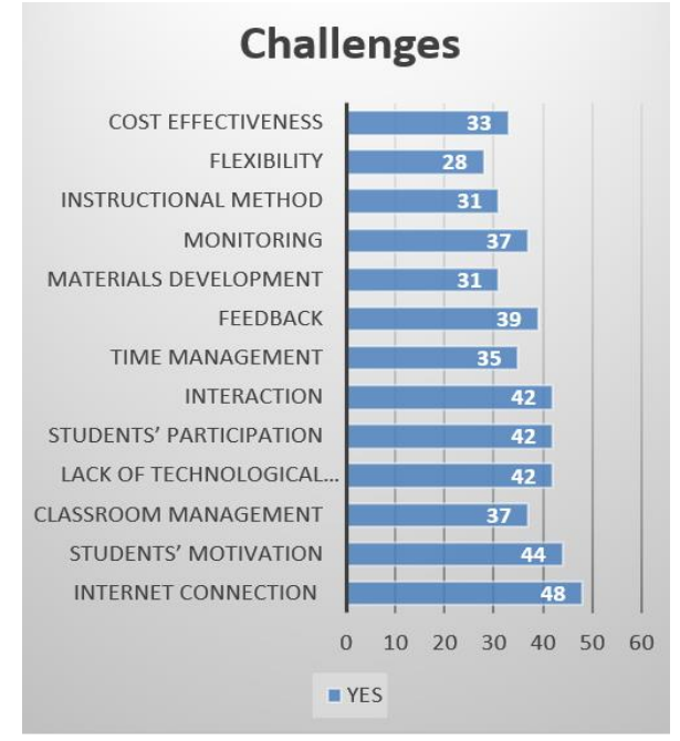
Figure 3. The challenges of synchronous and asynchronous learning

The research found some challenges faced by English Department lecturers during Synchronous and Asynchronous learning as shown in figure 3 below.