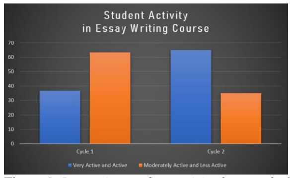
Figure 1. Increasing student activity from cycle 1 to cycle 2

active students in cycle 1 was only 36.7%, then increased in cycle 2 to 63.3%. Increased student activity in learning by using the learning community technique can also be seen in the diagram below: