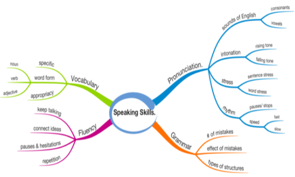
Figure 1. The four speaking skills and their parts

Speaking is one way to convey messages to other people. This message can be in the form of thoughts, ideas, complaints, and criticisms either directly or indirectly. Messages can be received well if the delivery can be understood by the recipient. For that, the messenger must have speaking skills. These skills include mastery of vocabulary, grammar, pronunciation, and fluency. The four speaking skills in questions are illustrated in Figure 1 below.