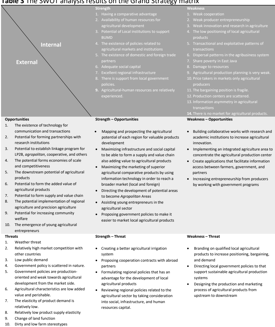
Table 3 The SWOT analysis results on the Grand Strategy matrix

strength and opportunity factors. It indicates that East Java Province has optimal support to establish Food BUMD in overcoming market imbalances. Several strategies that could be formulated based on internal and external factors can be seen in Table 3.