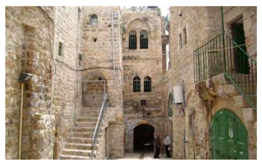
Figure 4. The bad situation of some houses in the old town of Jerusalem.

Almost one-third of the families live in the temporary housing in the old town. About 35% believe that low-income housing in the Old City helps to plan life for the physical savings of purchasing an apartment outside the Old City.