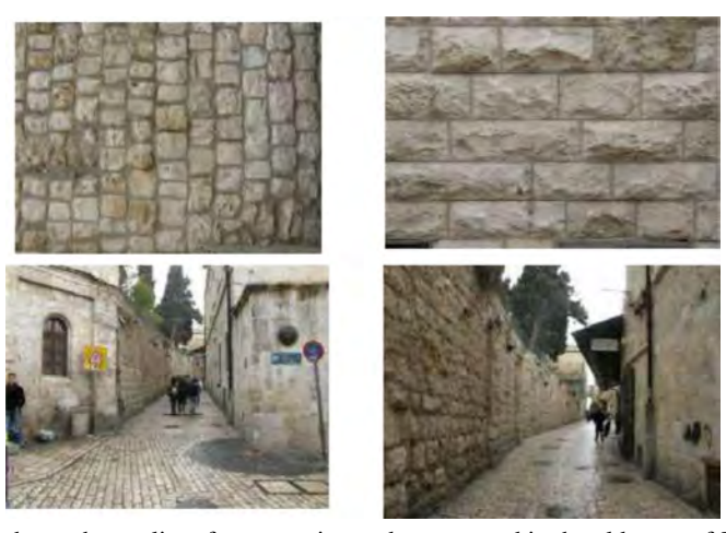
Figure 3. shows the quality of construction and stones used in the old town of Jerusalem

Since it is general knowledge that the buildings of the old town are built using stone, (Fig. 3), these buildings are cold in the summer and warm in the winter, so they can isolate the external weather and maintain a pleasant interior atmosphere. 64.1% of households use heat daily, 43.1% use heating appliances most of the time and 45.1% use them for at least 2 hours to 5 hours. These families report that their houses are very cold in winter while 58.5% of them use air conditioning, which is a fan in this case. The largest percentage of them, 59.5 %, of them also use air conditioners most of the time because of the fact that housing is too hot in the summer.