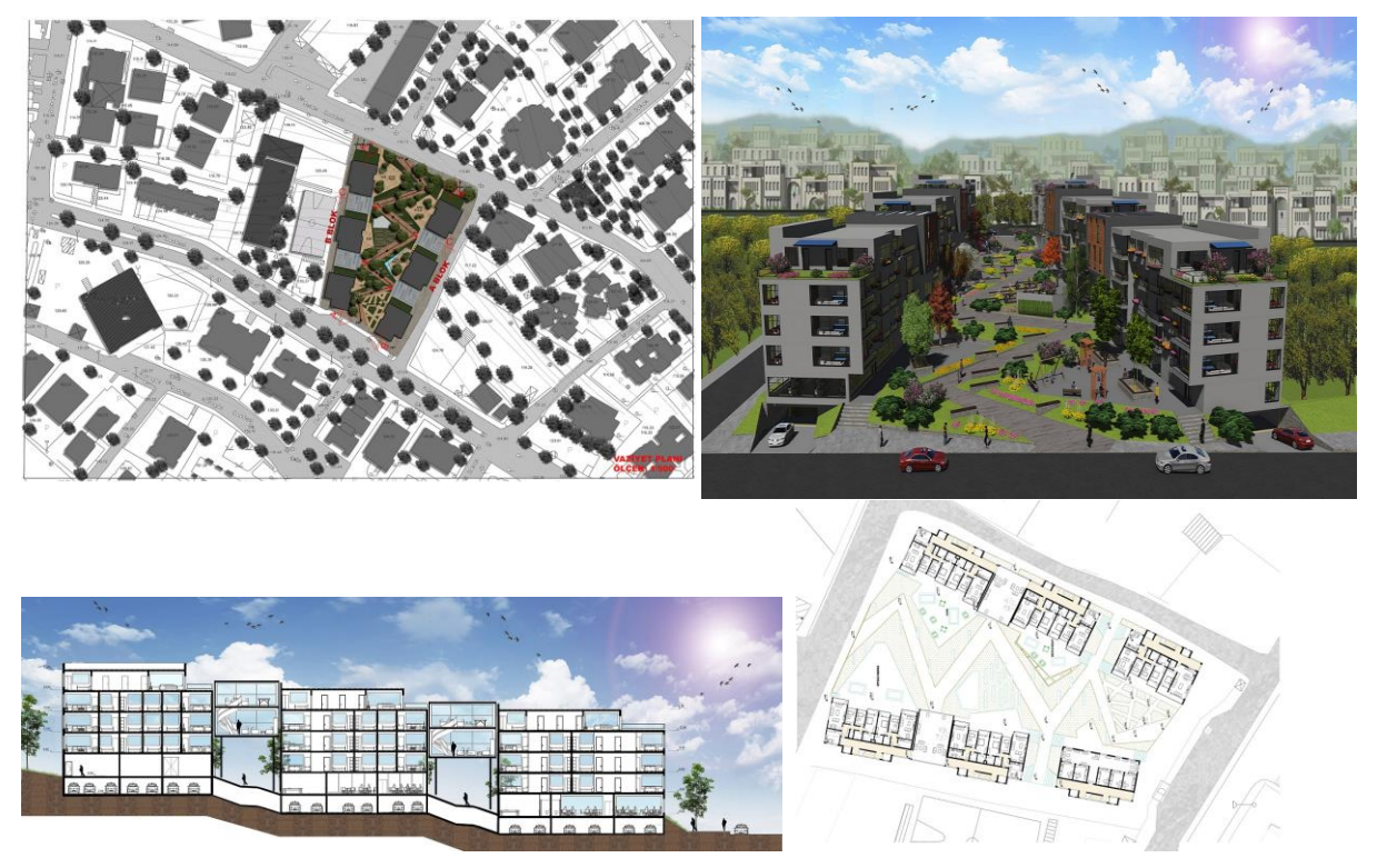
Figure 1. Muhammet Yusuf Birinci - Activity Valley

This building complex in which people are able to meet their social activities, various kinds of sportive activities and the other daily life needs, is located over a sloped land. The upper and lower level streets are connected with the public spaces between the housing blocks which are designed in harmony with the topography. People will prefer to live in these blocks, not only for their need of housing, but also for their social needs which are very important for an urban life. The green roof gardens of the blocks also serve the residents as meeting places, see Figure 1.