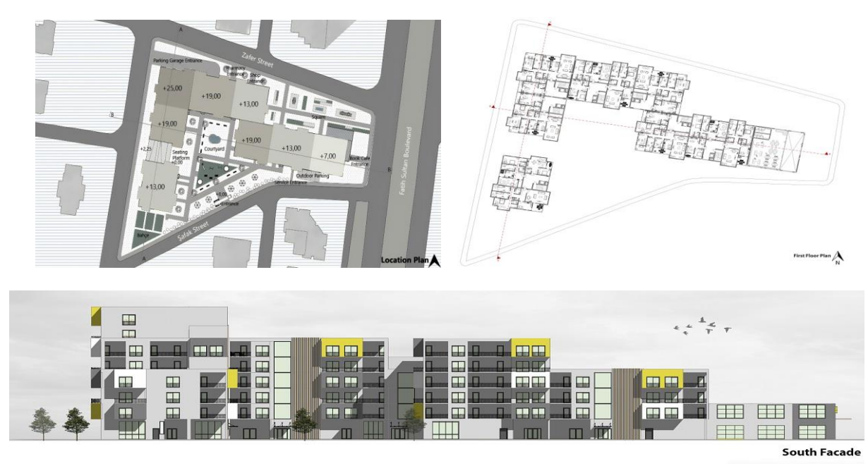
Figure 4. Zeynep Sena Sancak - Modular Living Space

The main aim of this mixed used housing complex is to offer social activities and shopping alternatives not only for its residents, but also for local people. The ground floor includes commercial and social spaces that are integrated with the public garden in the middle of the three main blocks. The uninterrupted pedestrian alley connects the main street with a greater public garden while the commercial axis invites people to the courtyard, which is an intersection of activities, see Figure 5.