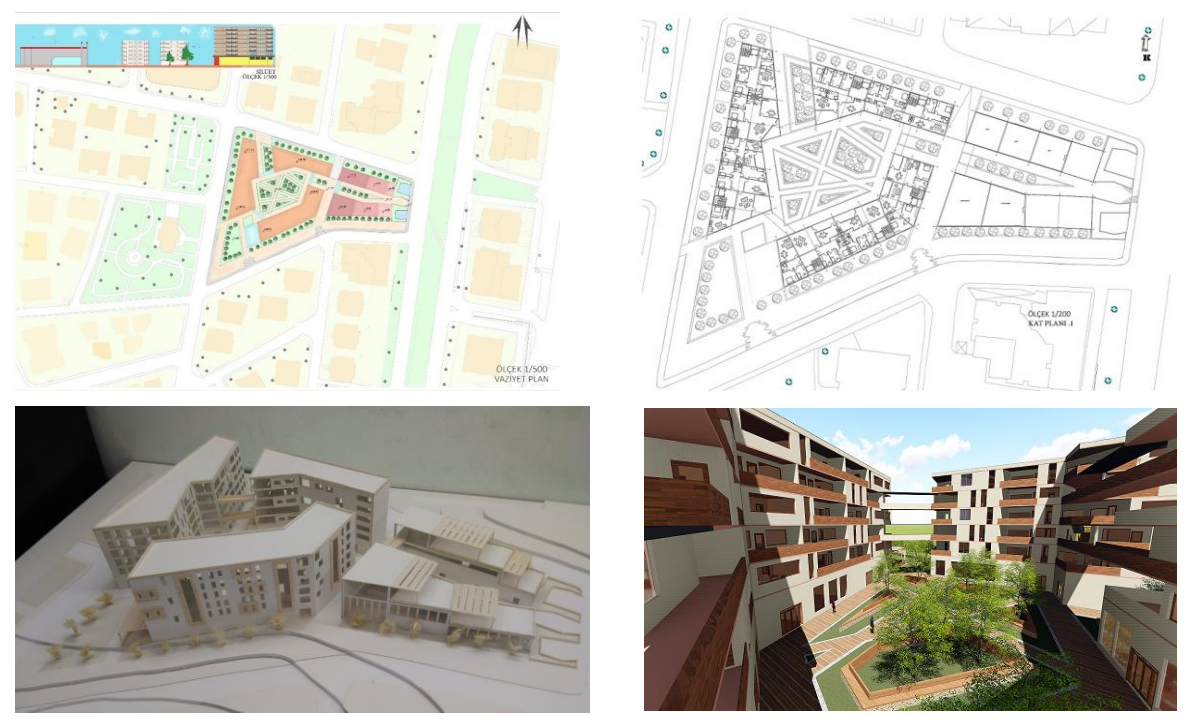
Figure 5. Merlinda Mollavequri- Intersection of Activities

The main aim of this mixed used housing complex is to offer social activities and shopping alternatives not only for its residents, but also for local people. The ground floor includes commercial and social spaces that are integrated with the public garden in the middle of the three main blocks. The uninterrupted pedestrian alley connects the main street with a greater public garden while the commercial axis invites people to the courtyard, which is an intersection of activities, see Figure 5.