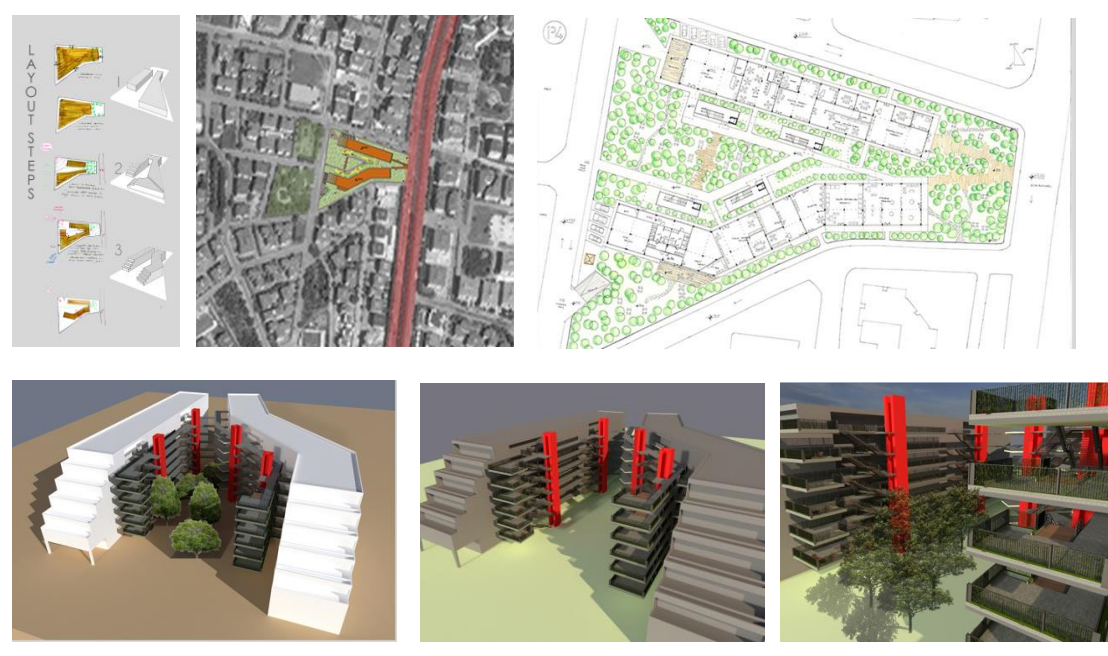
Figure 3. Zeynep Fazilet Kaya - GREEN CANYON

The main aim of this housing complex design is to provide green open spaces for people living in this high density neighbourhood. The unbroken fronts of the blocks create a canyon effect, where a public garden is formed at the more silent part of the building plot. This public garden constitute an open place for various kinds of social and cultural activities that take place on the ground floor of the blocks. The outdoor vertical and horizontal circulation system of the blocks let the residents to see eachother more than usual in their everyday life. The complex offers various types of flats for different life styles, see Figure 3.