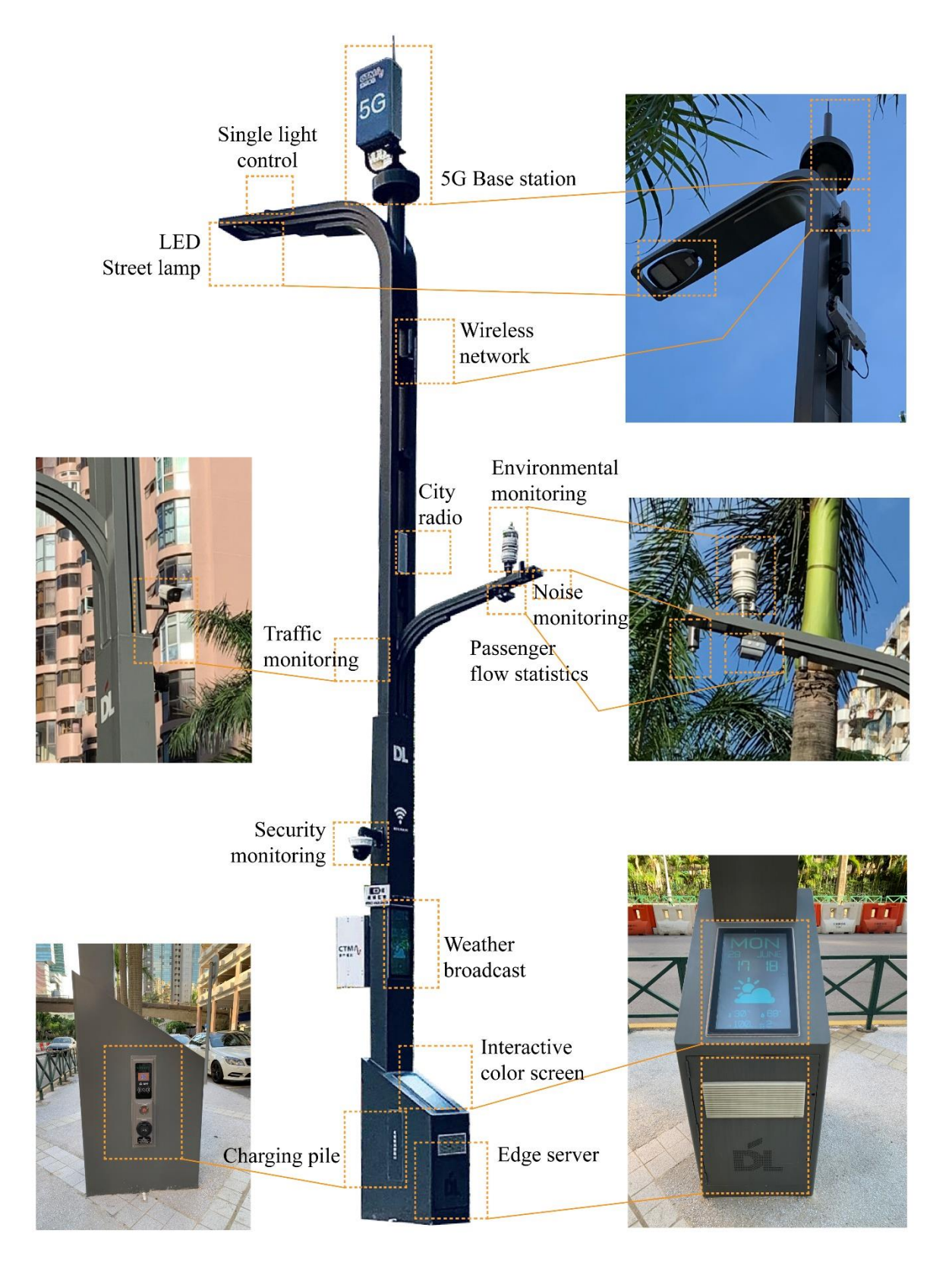
Figure 4 Function analysis of Smart streetlamps in Macau (Image source: drawing by the author)

2) A cross-departmental integrated management platform that integrates up to 20 types of smart devices, and can carry 72m/s wind resistance and withstand the strict requirements of subtropical storm surge, supports multiple different business management departments, independent management of equipment, and unified deployment of communication interfaces (see Figure 3);