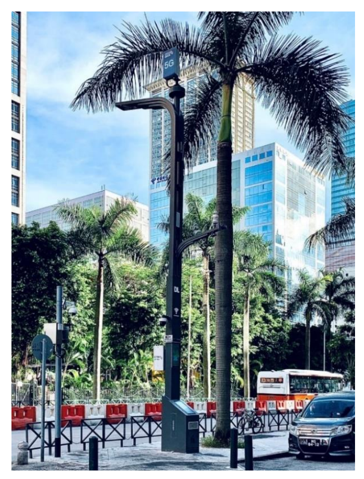
Figure 3 Smart streetlamps in Macau

1) Adopting a "holistic" Smart streetlamps design, and the appearance of Smart streetlamps that are more in line with the local customs of Macau and the image of an international city, thereby enhancing the modern urban landscape of Macau (Figure 1);