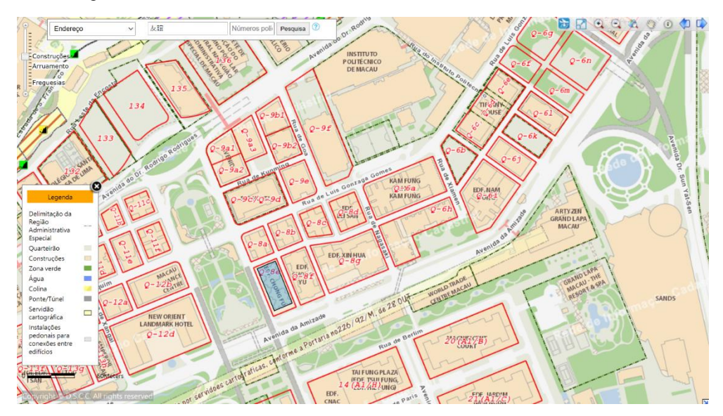
Figure 1 Smart streetlamps in Macau

According to field investigations and records, the current Smart streetlamps in Macau are only installed at the intersection of Avenida da Amizade(see Figure 1). This section is dotted with office buildings, schools, casinos and hotels of different heights. It is one of the busiest sections of the Macau Peninsula.