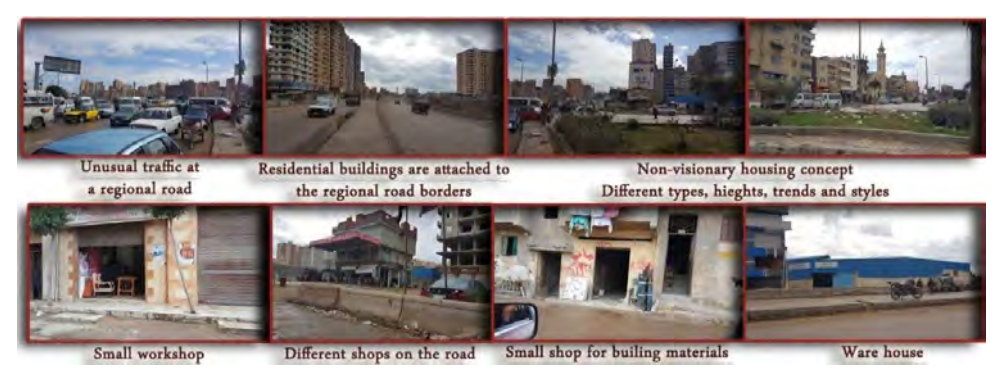
Figure 6. Facilities at the 45th Road (Yoseph, 2017)

There was not a certain vision when the razing and urbanizing processes were done even though the attached urban context to each entrance is shaped by a certain type of the economic activities and land use (see table 1). The Suez Canal Road is connected to the city center. The projects that have been established succeeded in attracting users such as clubs, hypermarkets, malls, cafés, restaurants, and similar facilities. The 45th Road in there is connected to almost the three biggest districts in Alexandria City; the type of projects are schools, hypermarkets, and mega housing projects.