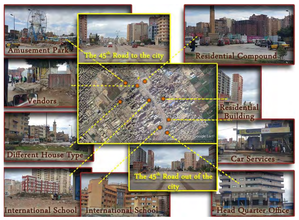
Figure 4. The urban image at the 45th Road (Yoseph, 2017)