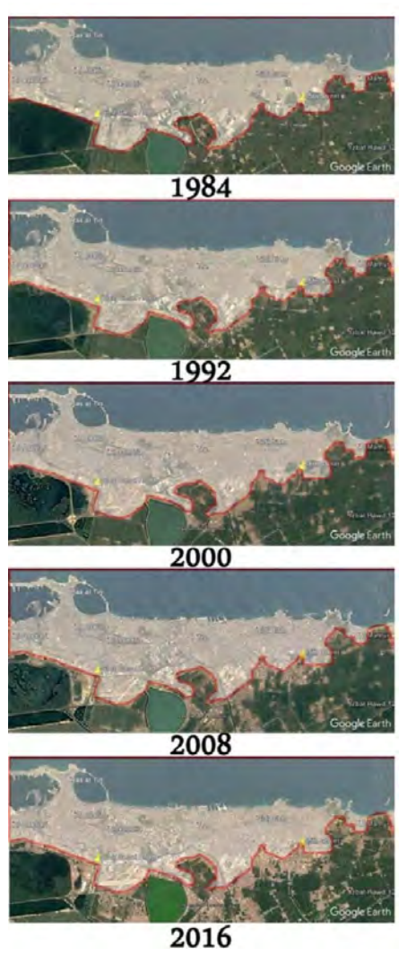
Figure 1. The city growth over the last four decades (Google Earth, n.d.)

The Suez Canal Road became the recreational destination for Alexandria city inhabitants while the 45th Road became a destination for essential facilities.