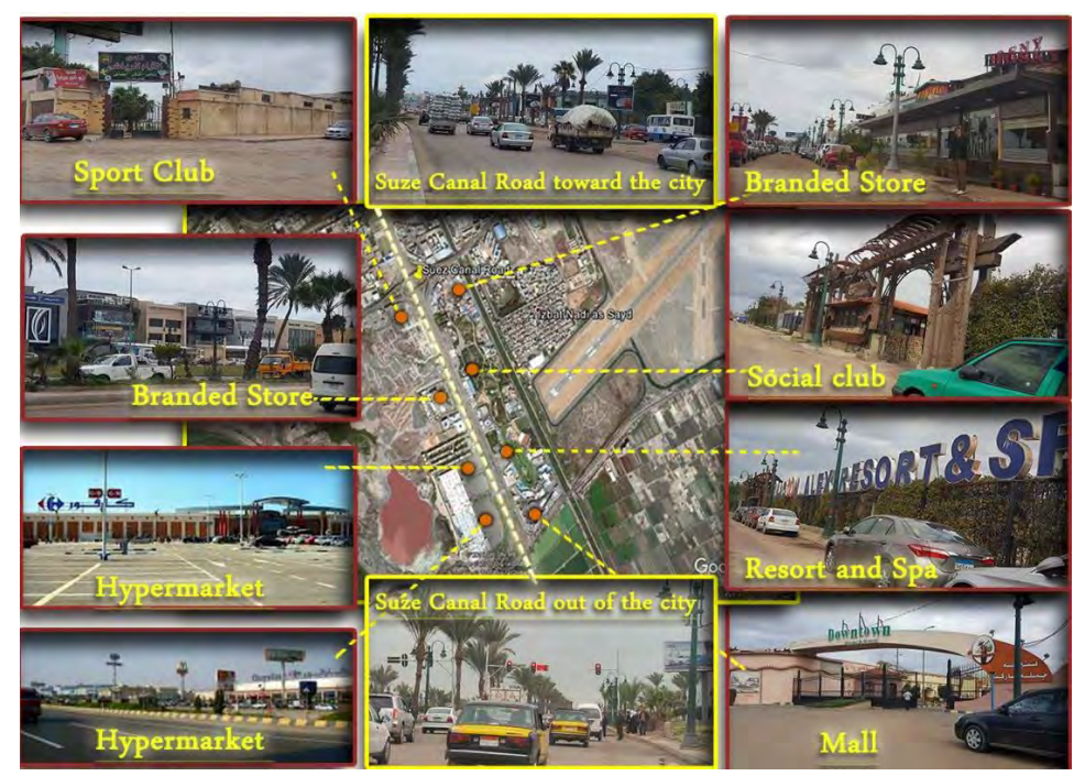
Figure 3. The urban image at the Suez Canal Road (Yoseph, 2017).