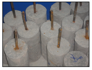
Fig. 1. Samples for pull out test

where P is the required force to pull the embedded bar out of concrete specimen, L is the anchorage length of the bar in concrete specimen and d is the bar diameter. The average value of the five samples was recorded as concrete bond strength.