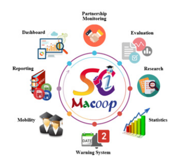
Fig. 2. Administrative and university services of SIMACoop