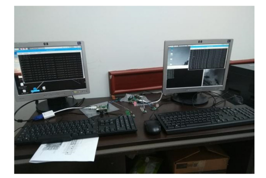
Fig. 4. Debian installed on Raspberry Pi 3 module with RF added

The energy consumption in wireless communication is important. The lifetime of the battery can be calculated according to the equations below [5]: