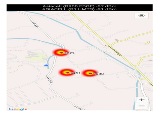
Fig. 4. Locations and ID of the tested cells by OpenSignal

Two mobile software applications were used: CellMapper 5.1.7 and OpenSignal 5.37. The first was used to acquire the frequencies of the tested cell ID and the received power, while the other one was used to show the BS towers' location (Figure 4). Received power, frequencies, and the running protocol for tested cell IDs were measured. In order to cover different environments, several cells with different protocols (GSM, UMTS, DCS 1800, etc.), frequencies, and distances were tested. The tested cell IDs were 50828, 52295, and 51515 at a distance of 100m, 51515 at 1000m, 50826, 52297, and 51511 at 200m, and 51511 at 800m (Figures 5-7). The summary of the test results is presented in Table II.