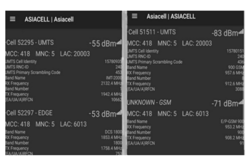
Fig. 6. Results of 52295 and 51511 cells