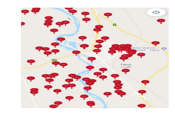
Fig. 1. Asiacell's communication towers in Tikrit by Open Signal Program