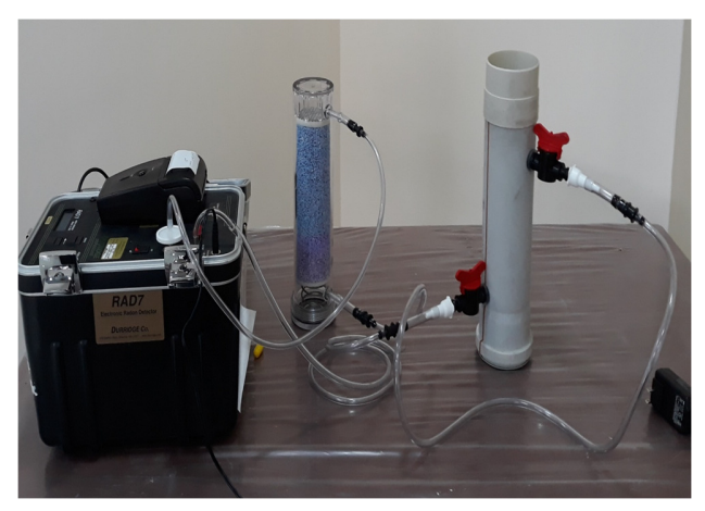
Fig. 1. Method of radon concentration measurement.

At equilibrium state, the flux (exhalation) of radon from the sample inside the can in terms of area and mass can be measured by [7]: