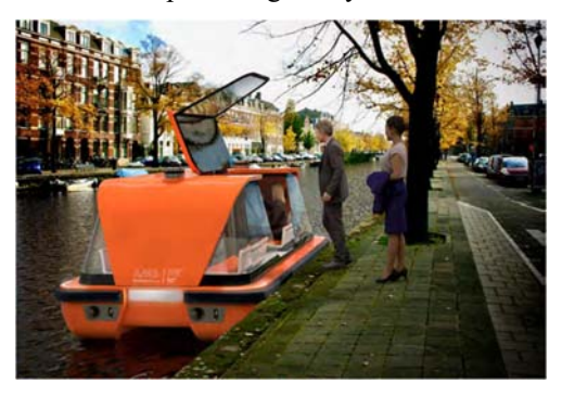
Fig.9. Autonomous river transport imagined by Roboat on the canals of Amsterdam

The autonomous boat benefits from technology transfers from the automotive industry, with however adaptations to the specificities of the maritime world. For example, the boat must navigate on a moving surface, which complicates the maneuvers and requires more complex trajectory calculation algorithms than those used for the road; this is particularly the case for mooring manoeuvres. However, since the speed is lower than on the road, remote control from the command center is less demanding in terms of communication latency. In addition, the boat is not confined to a predefined route, which allows greater flexibility in avoidance operations.