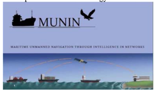
Fig.1. MUNIN study

The study of unmanned navigation developed from 2012 to 2015 by the European Commission through the MUNIN Project sought to develop the concept of an unmanned ship from a theoretical point of view, but also developed the NSE Technology Scheme.