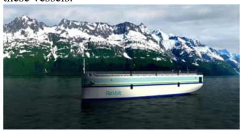
Fig.4. ReVolt project

The other partners of the AAWA project are also actively working on the design of these vessels.