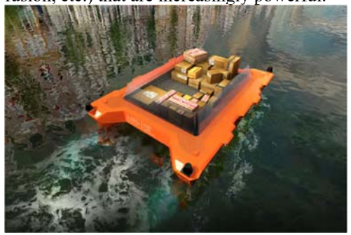
Fig.8. River solution for automated parcel transport designed by Roboat

sensors required. The latter feed deterministic algorithms today, and tomorrow artificial intelligence systems (pattern recognition, data fusion, etc.) that are increasingly powerful.