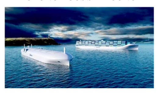
Fig.3. AAWA prototype

The study of unmanned navigation by the AAWA working group focused on analyzing the feasibility of the concept, in parallel with the development of its technological scheme and the design of the first prototypes.