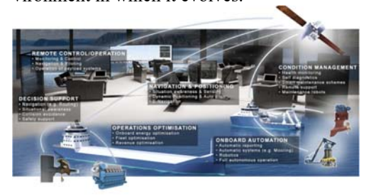
Fig.7. AAWA concept

The AAWA concept is based on linking systems for situational awareness, collision avoidance, trajectory planning and ship status. All of the data that will be collected by the various sensors and systems will be analyzed by the autonomous navigation system (ANS), itself in conjunction with Rolls Royce's dynamic positioning system, in order to allow the ship to define the best trajectory and to have the widest possible knowledge of the environment in which it evolves.