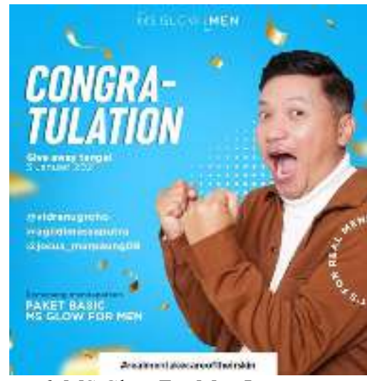
Figure 6. MS Glow For Men Instagram post on January 7, 2021

On January 4, 2021, it made a challenge to make a story, from quality, quantity to following the challenge consistently.