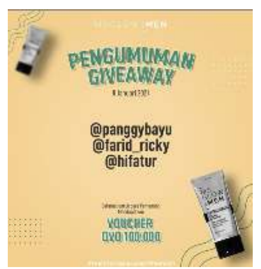
Figure 7. MS Glow For Men Instagram post on January 13, 2021

On January 13, 2021 MS Glow For Men made a "Giveaway" to complete the word Bright Cream. The lucky "Ms Bro" is entitled to an OVO worth 100,000 Rupiah.