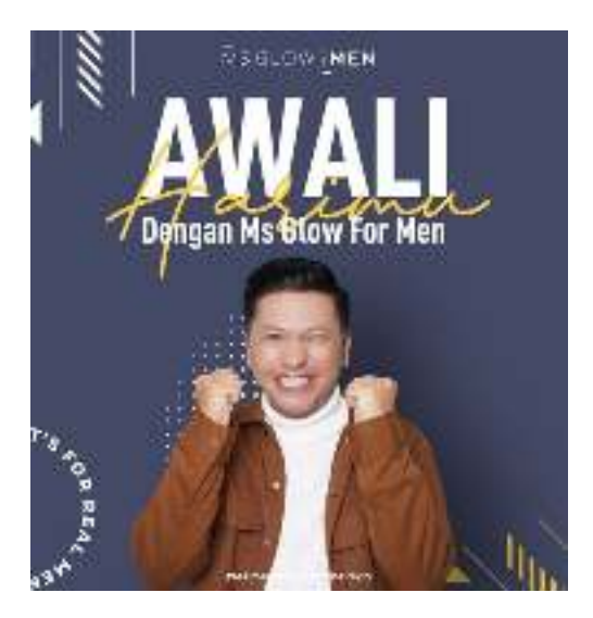
Figure 3. MS Glow For Men Instagram post on January 5, 2021

MS Glow For Men on Instagram provide information related to the product in advertising as seen in the following pictures.