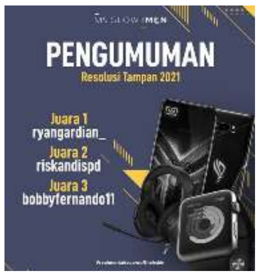
Figure 5. MS Glow For Men Instagram post on January 4, 2021

As posted on January 3, 2021, MS Glow For Men gave a giveaway with the basic MS Glow For Men package by guessing the value of the facial wash based on the clue in Figure 3 with the tag on 5 friends.