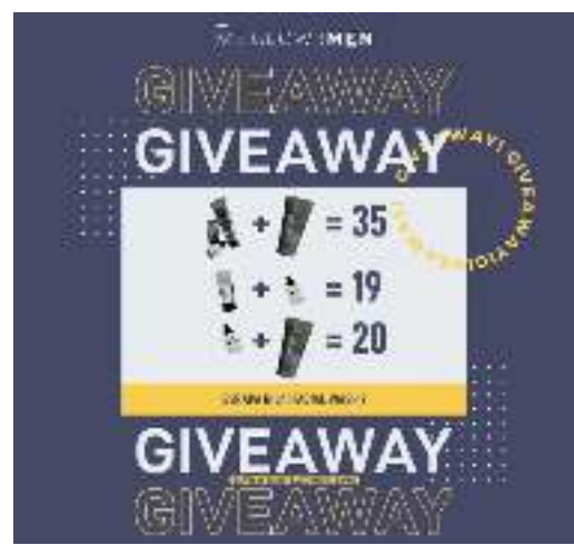
Figure 4. MS Glow For Men Instagram post on January 3, 2021

MS Glow For Men on Instagram uses "Give away" to attract male potential consumers as a form of sales promotion as seen in the following pictures.