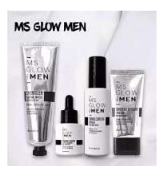
Figure 1. MS Glow For Men Products

Attitudes for Applying Skin Care. While factors that influence the consumer behavior of men in Bandung, Indonesia consists of Beliefs in Attributes Product Aspect, Self-Image Aspect and Aging Effects [12], one of the facial care products is MS Glow For Men.