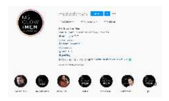
Figure 2. Instagram Profile of MS Glow For Men

This study used the Holsti formula to calculate the data from two coders [20]. The content analysis method was chosen because the researchers tried quantitatively to see the content of Instagram posts, then the researchers tried to interpret post content, read symbols, and interpret the symbolic interaction content of Instagram posts @msglowformen.