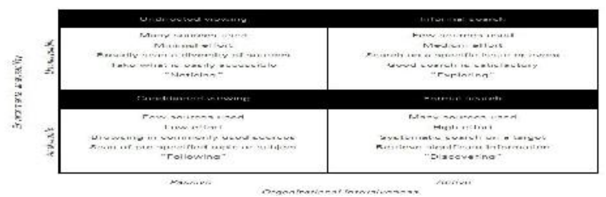
Figure 2. Model scanning activity (Kemp & Hanemaaijer, 2004)

Scanning is gathering information about events and relationships in the external environment to gain knowledge that will guide top management in defining the company's actions in the days to dating (Aguilar, 1967). Choo (1998) frame scanning activities into four aspects (Figure 2).