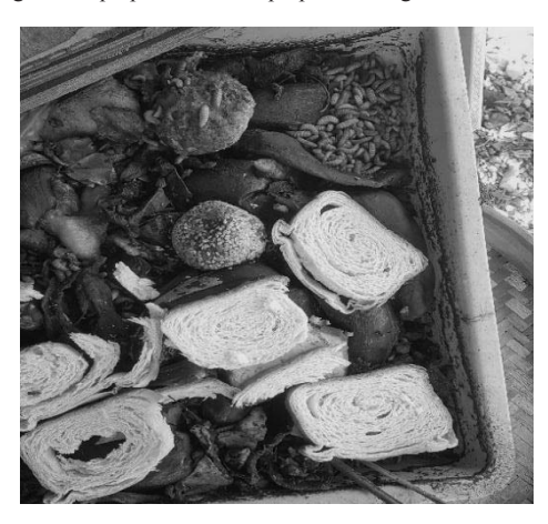
Fig. 5 Feeding Process

In maggot cultivation, the media that is a place to grow must contain sufficient nutrients. Nutrient is one of the most influential factors on the biochemical composition of natural feed. The nutrients contained in the cultivation media greatly affect the productivity value of the quality of the maggot produced. In this study, the nutrients provided were found in the cultivation media consisting of tofu pulp and coconut pulp mixed together.