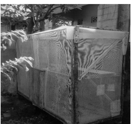
Fig. 2. BSF Fly Cage

The space provided must be flexible because this cultivation business can use vacant or unused land as a place of cultivation. This is due to the lack of criteria in selecting a place to cultivate BSF, namely the presence of a place exposed to direct sunlight. This criterion only applies to adult flies, while larvae and pupae are not required at all.